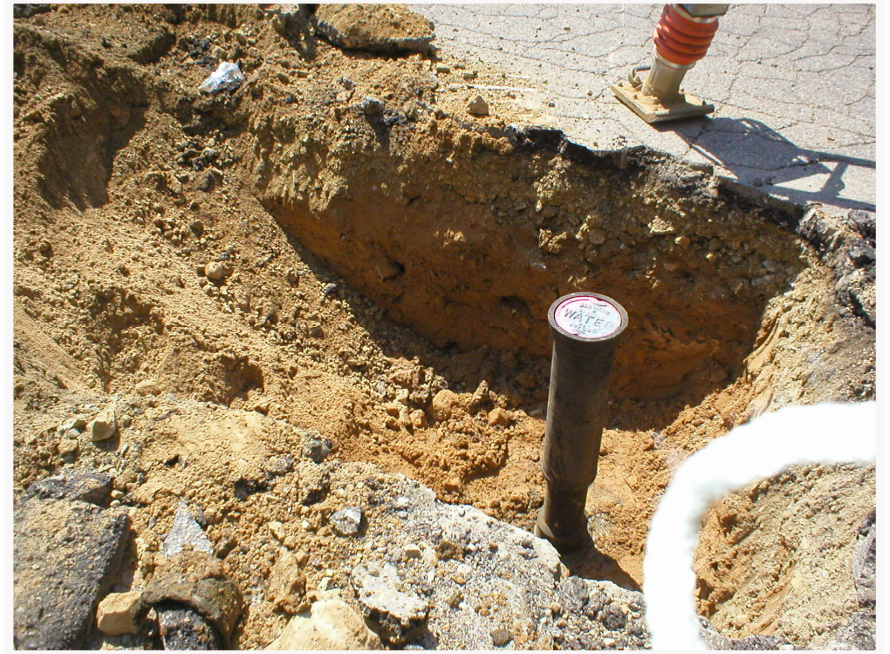
Adjusting water valve boxes to final grade