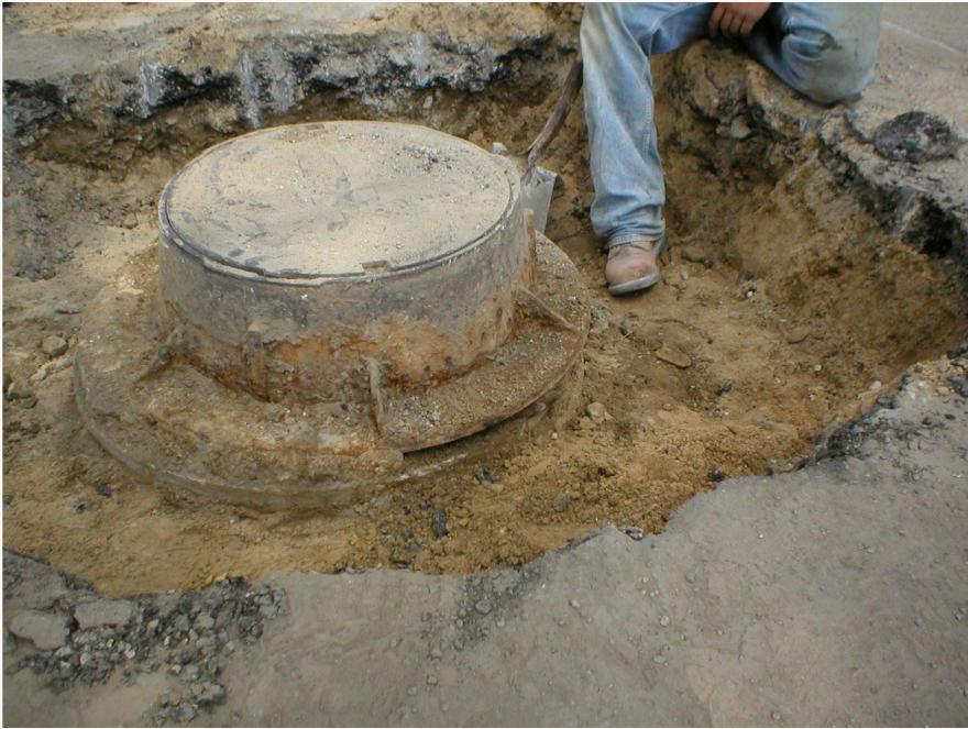
Adjusting manhole castings prior to paving