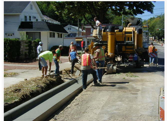
Machine Placed (Bottom)