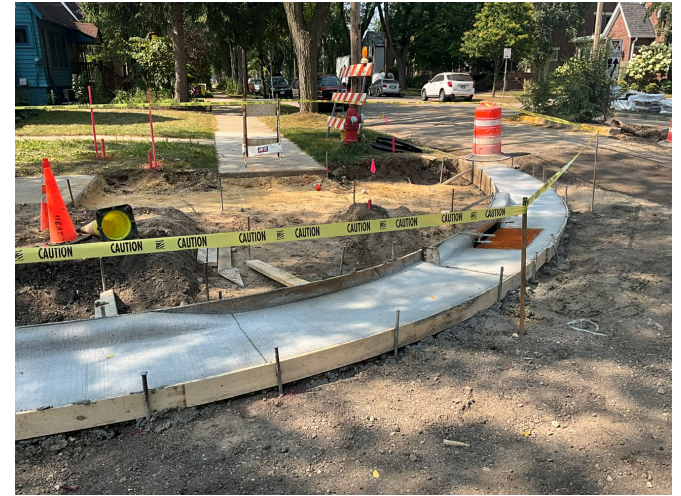
Hand Placed (Top)