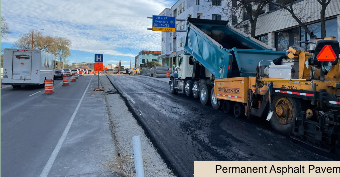
Permanent Asphalt Pavement (East of Hill St.)