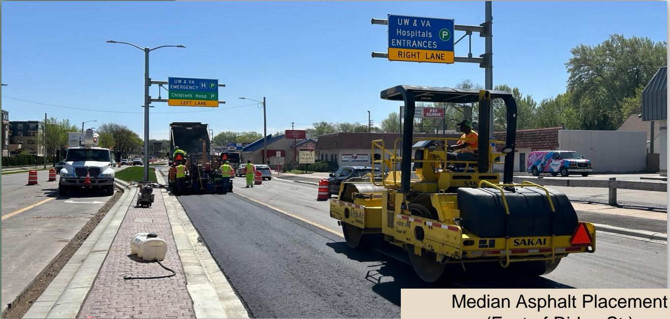
Median Asphalt Placement (East of Ridge St.)