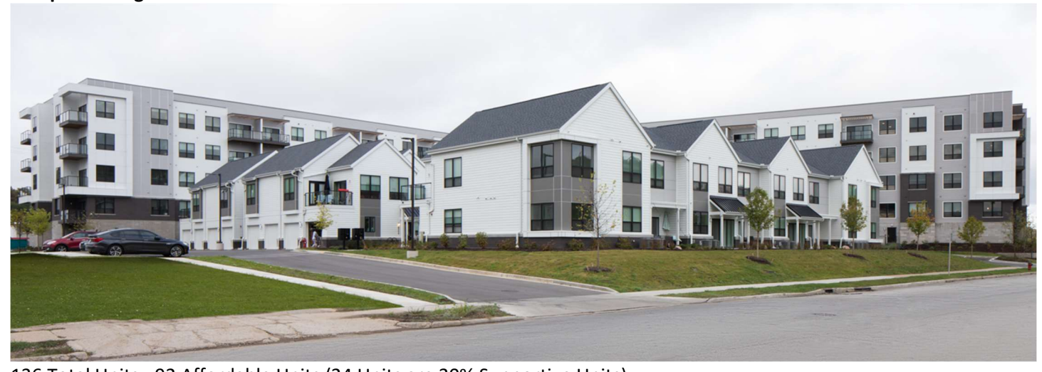
136 Total Units - 92 Affordable Units (24 Units are 30% Supportive Units)