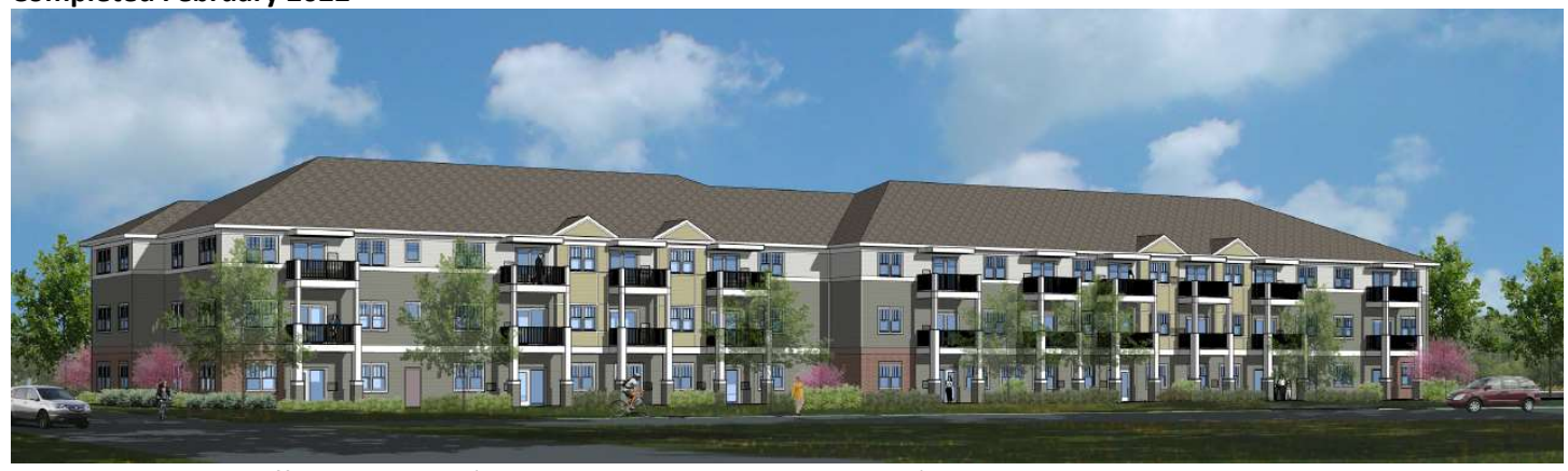
51 Total Units - 48 Affordable Units (11 Units are 30% Supportive Units)