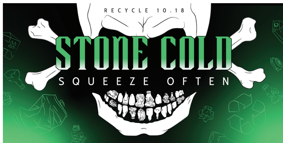
This is the name of our electric compactor for recyclables at our Sycamore Avenue location.