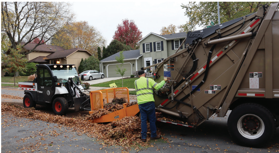
Yard waste collection.

There are many more leaf pickup crews than sweepers. And sweepers are very slow vehicles. This means there will be a gap between pickup and sweeping. We try to keep the gap as short we can.