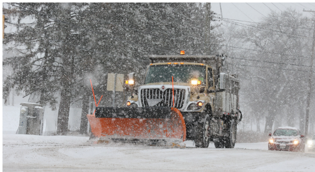
Our crews respond 24/7 to snowstorms.

Snow emergencies are declared to assist with plowing operation by requiring everyone throughout Madison to follow alternate side parking rules. Fines for violating the alternate side parking rules increase during a snow emergency, and you are more likely to be towed.