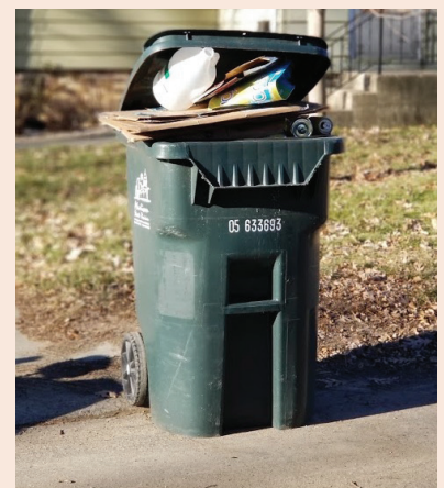
Look familiar? You can get a bigger cart for free!

Have you ever missed your trash day because you forgot about a holiday? Or maybe a snowstorm canceled pickups? You can stay informed about all these situations by signing up to receive emails each time the schedule is delayed. Do that at www.cityofmadison.com/CollectionSchedule .