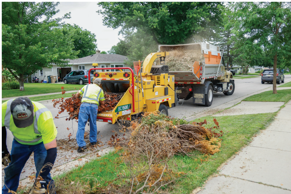
Crews feed brush into wood chippers by hand.

If you hire someone to trim trees, shrubs, and bushes your contractors must haul it away. Crews will not collect it at the curb. Contractors cannot take it to a free drop-off site.