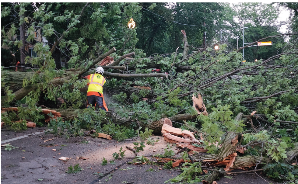
When city trees fall in storms, our trained arborists respond to help.