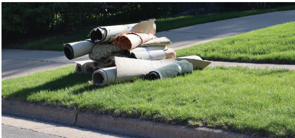
Perfect stack of carpet out for pickup. Well done!

Large item collection is two separate crews. One collects metals and appliances for recycling. The other collects items going to the landfill. They will arrive at different times.