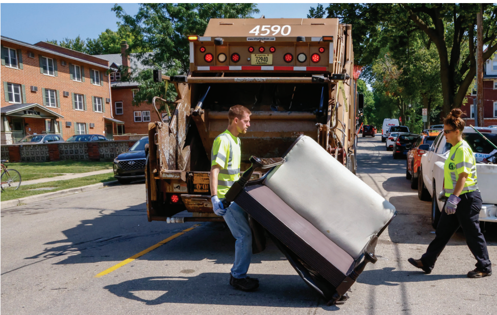
Donate usable items so we don't send them to the landfill.

Remember – there are items banned from trash carts, like microwaves, televisions, computers, dehumidifiers, tires, and other items as mentioned on page 5 .