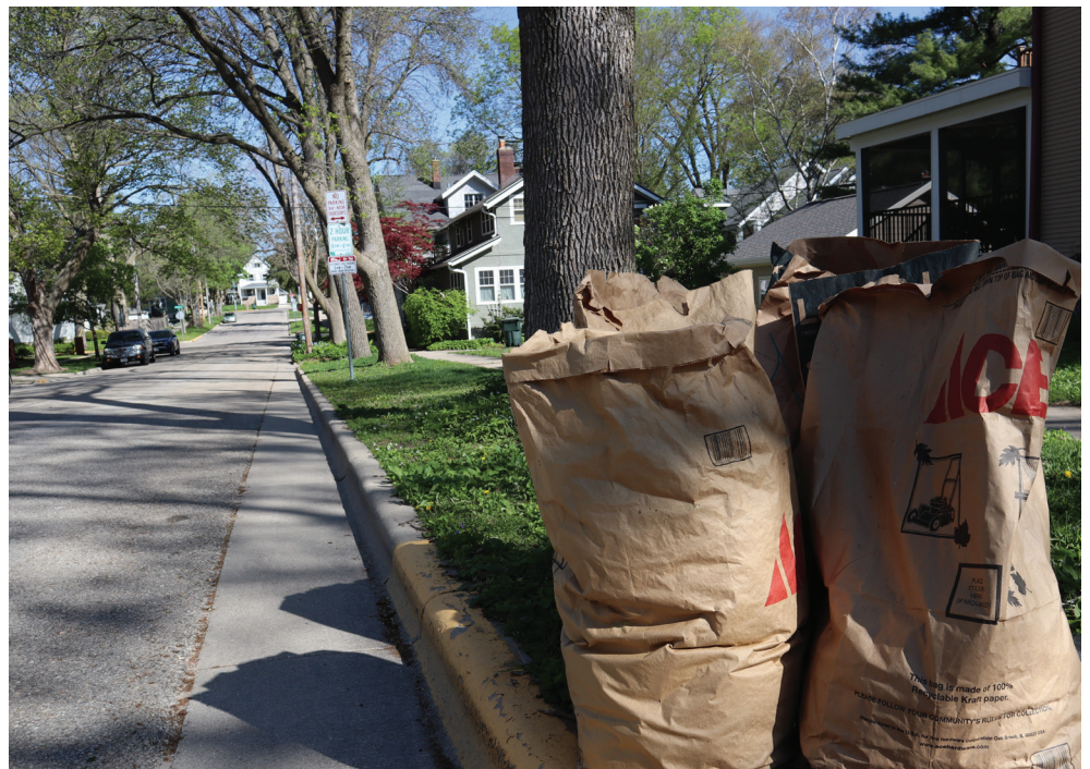
Yard waste bagged for pickup.