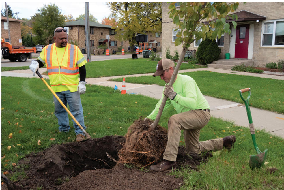
90% of the trees planted in 2024 were large canopy trees.