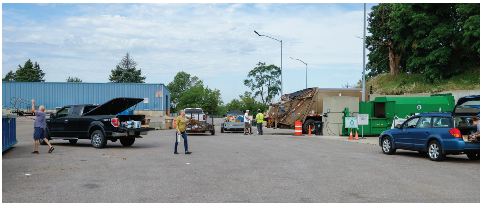
Drop-off sites can be busy places!

If you do not pay the special charge, you must pay the required fee for the item before dropping the item off at the drop-off site.