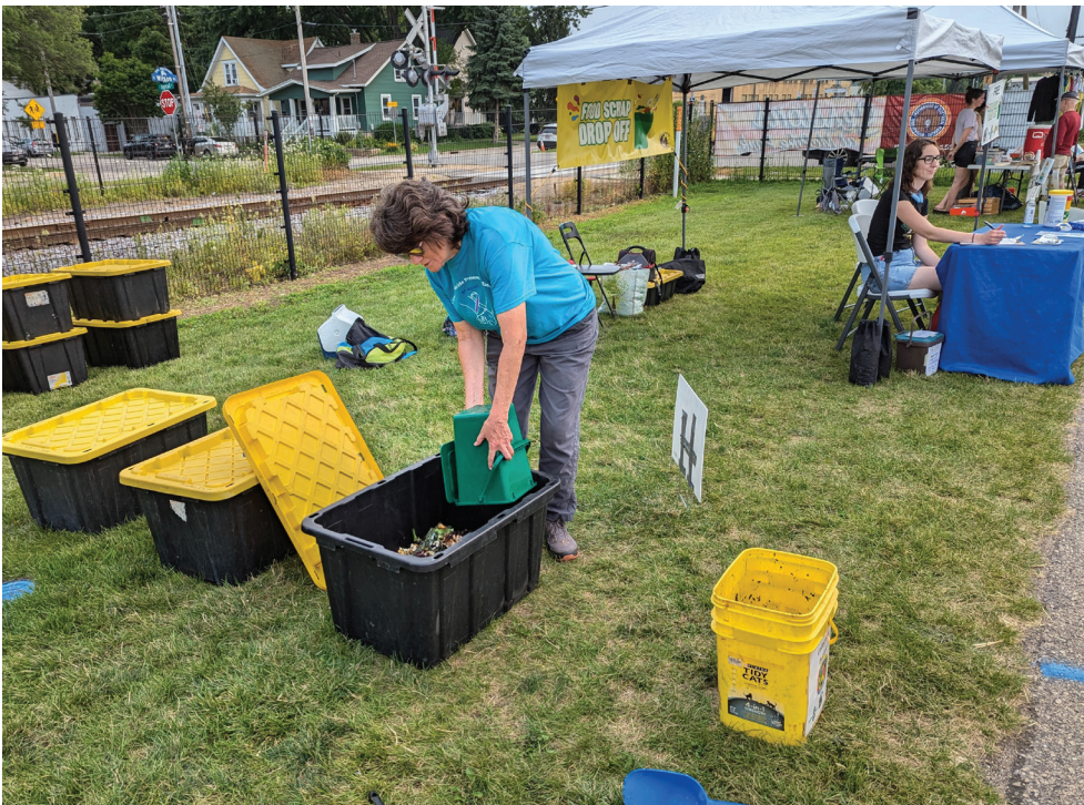
Collecting food scraps at the East Madison Farmers' Market. There are other drop-off spots around Madison.

The website for all of this information is available at www.cityofmadison.com/Foodscraps .