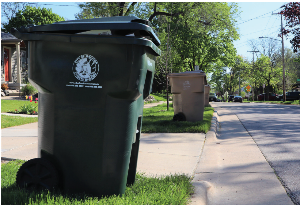
This is a good example of how carts should be placed for a single family home on recycling day.

Each home serviced by the Streets Division has one trash and one recycling cart provided by the City of Madison. When you move, these carts stay with the home. If you bought any extra carts, you can take only the extra ones you purchased.