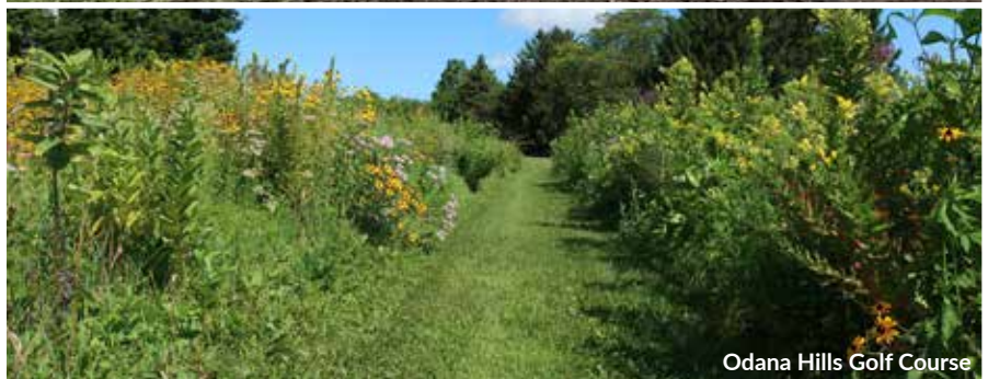
Odana Hills Golf Course