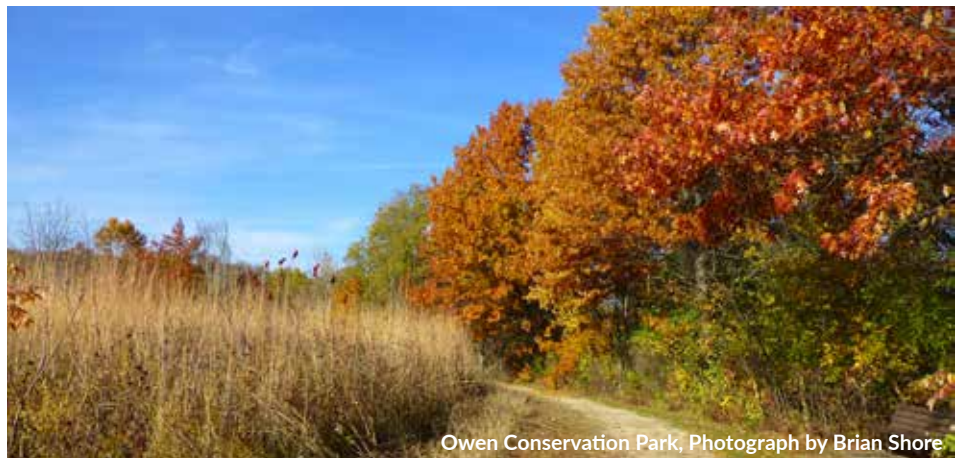
Owen Conservation Park

cityofmadison.com/parks/find-a-park/conservation/tours.cfm