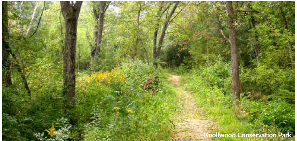
Knollwood Conservation Park