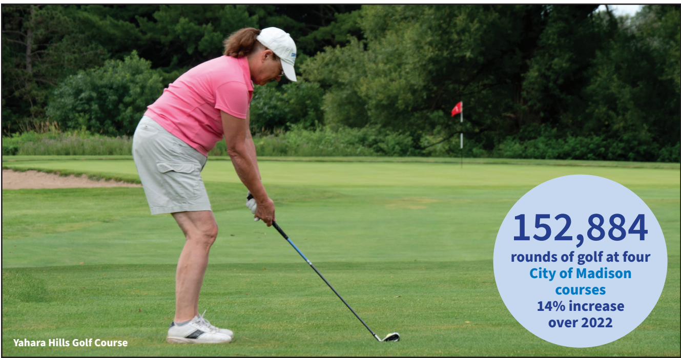
Yahara Hills Golf Course

152,884 rounds of golf at four City of Madison courses 14% increase over 2022