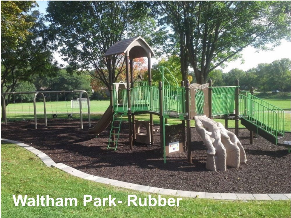
Waltham Park- Rubber