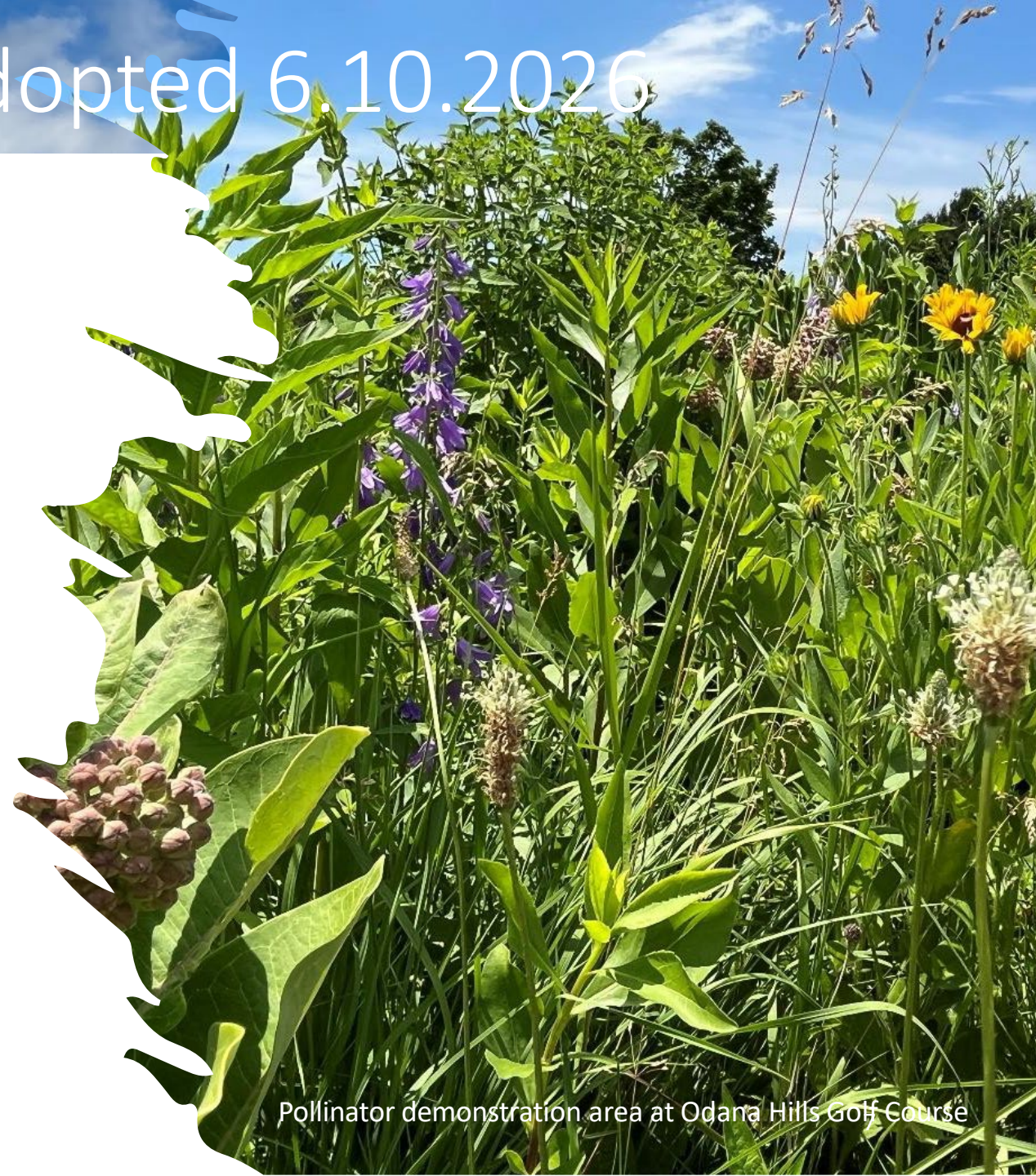
Pollinator demonstration area at Odana Hills Golf Course