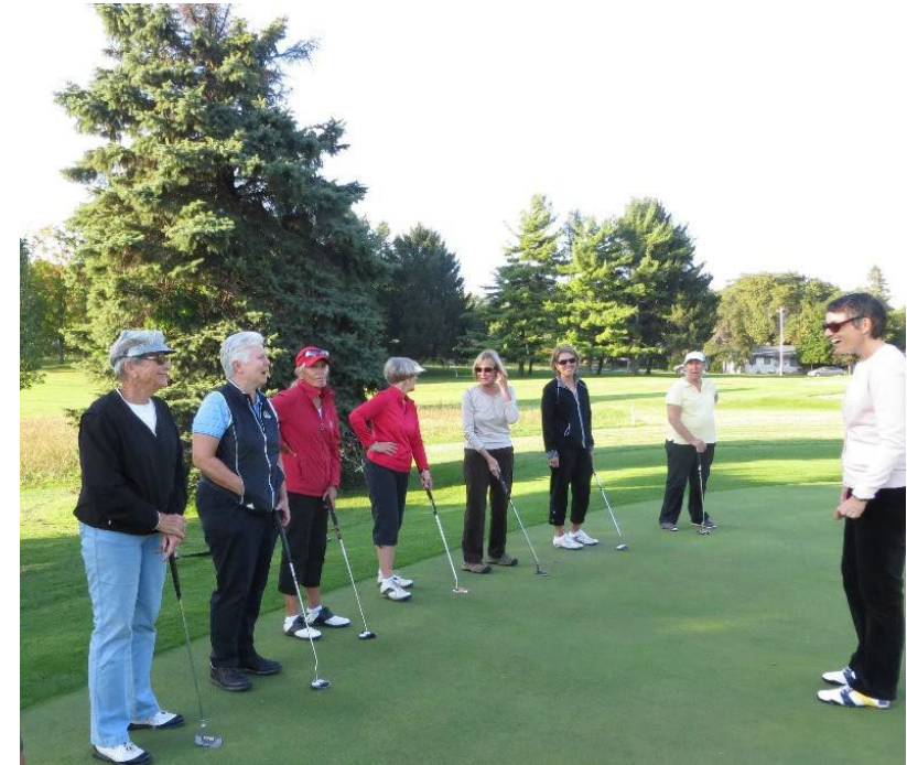
Change Golf instruction session at Odana Hills