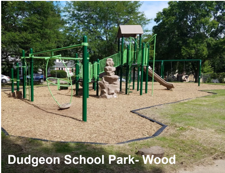
Dudgeon School Park- Wood