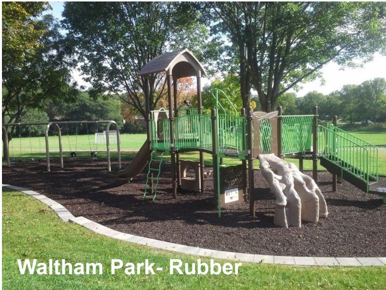
Waltham Park- Rubber