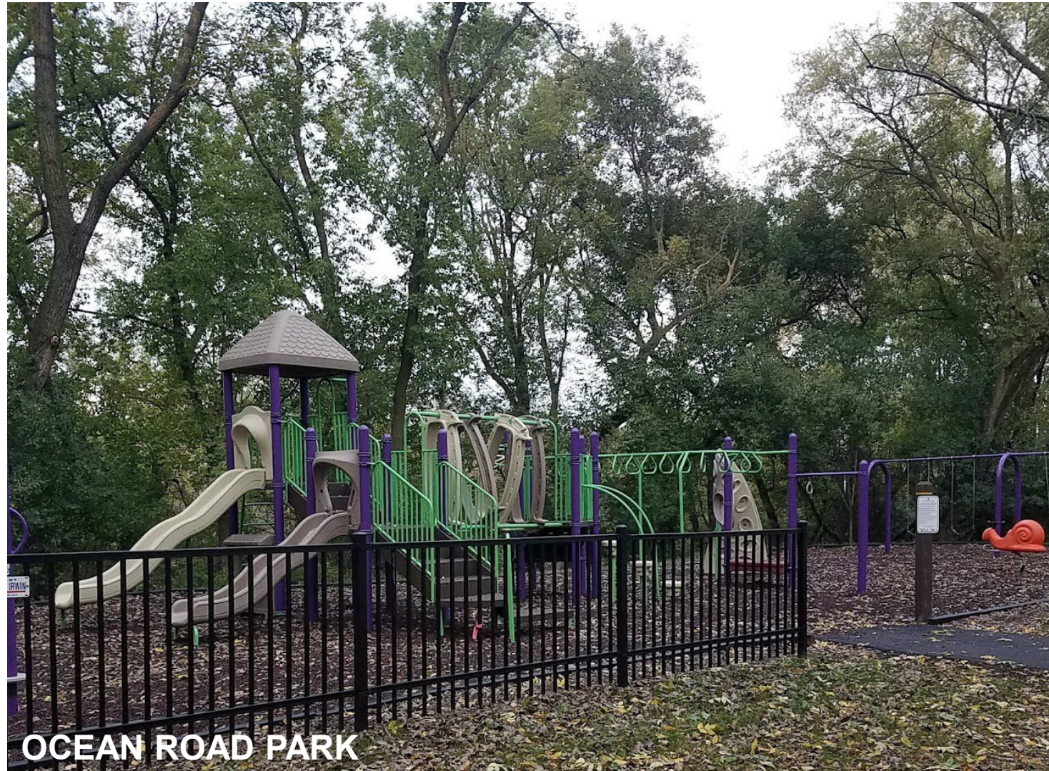
OCEAN ROAD PARK