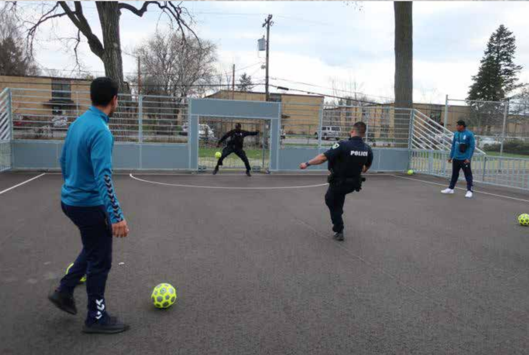
Penn Park futsal court before final surfacing