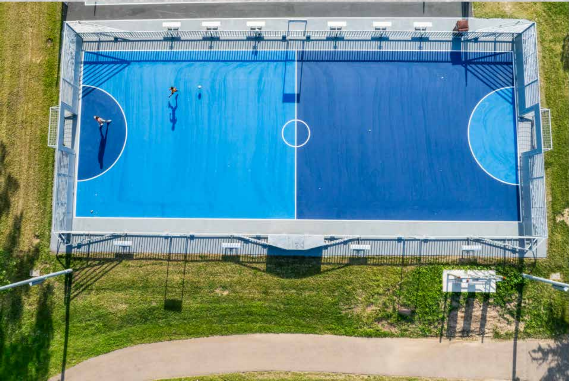
Penn Park futsal court, opened in 2024.