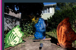
2015 Sherman Yard Art Project $4,703 Grant