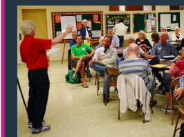
2016 Crawford-Marlborough-Nakoma Neighborhood $4,550 Grant