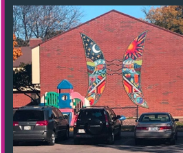
2016 Bayview Neighborhood Mural, $5,000