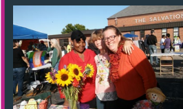
2017 Worthington Park Neighborhood Pop-Up Market, $1,000