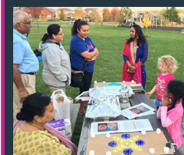
2017 Secret Places Neighborhood Association Building Extravaganza, $1,000