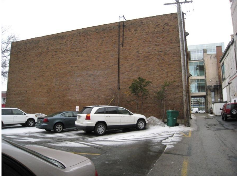
NW Exposure of Warehouse and Alley