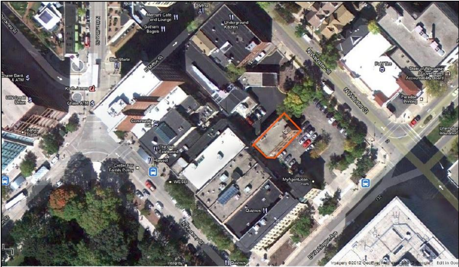
Blind Warehouse Outlined in Orange