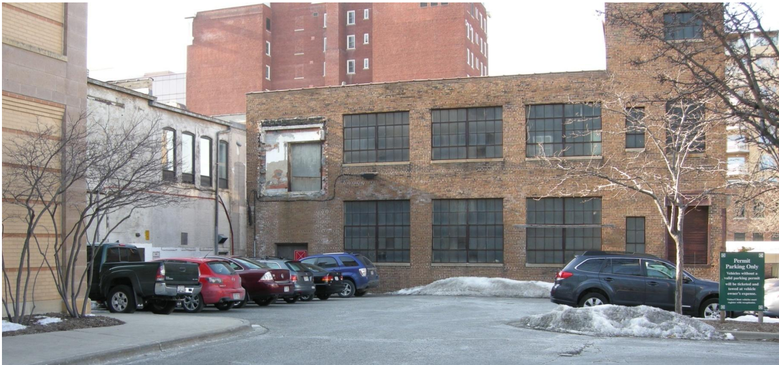
View from E. Washington Parking Lot Entrance