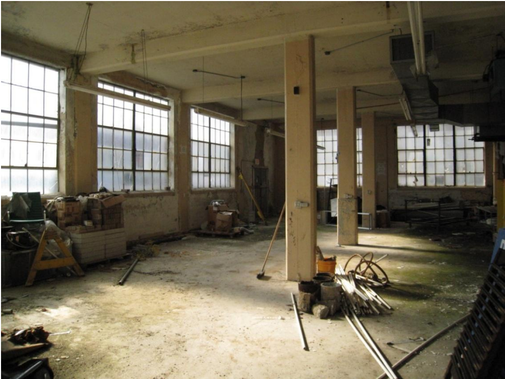
First Floor Views