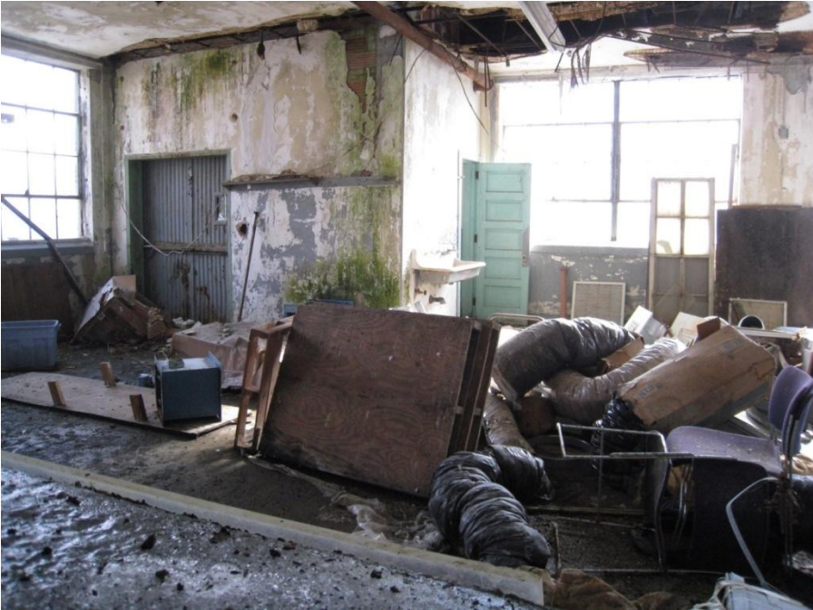
Second Floor Views