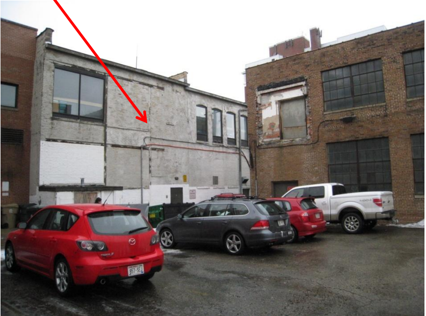
NE and SE Exposure of Warehouse