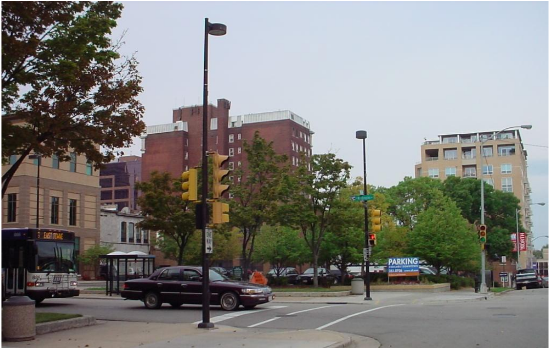
View from E. Wash and Webster