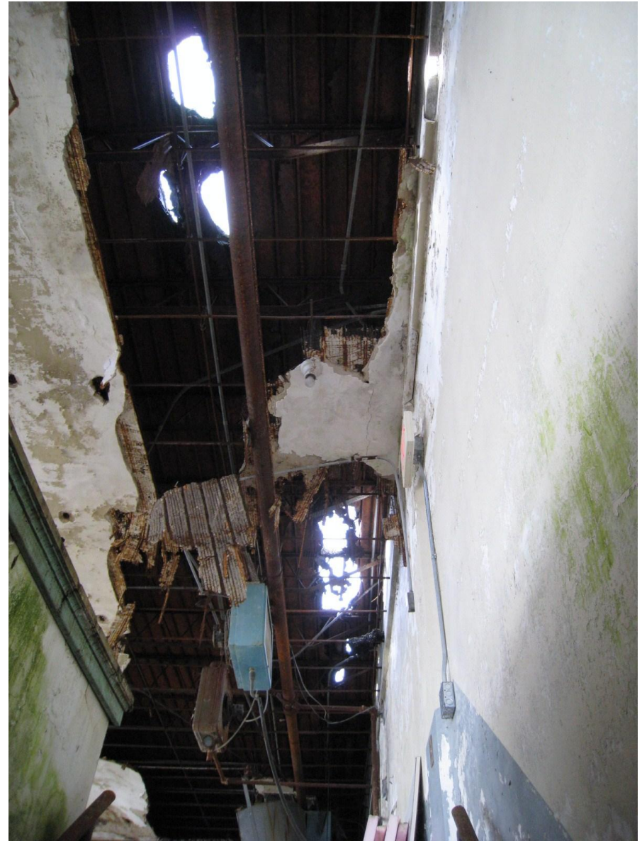
View from Stairwell – Exposed Roof