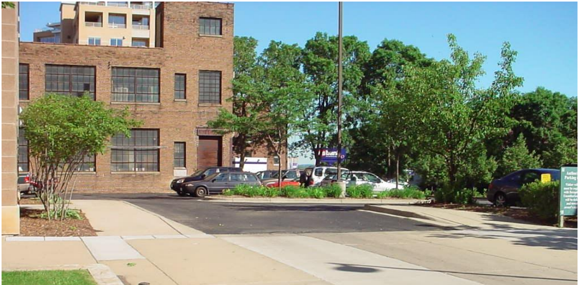
View from E. Wash Southeastern side of Warehouse