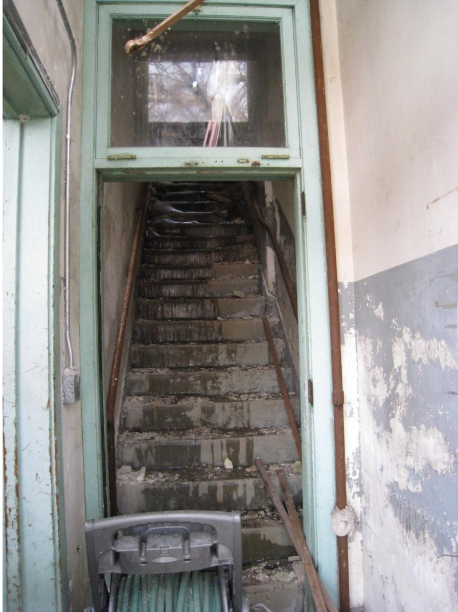
Stairwell from 1 st to 2 nd Floor