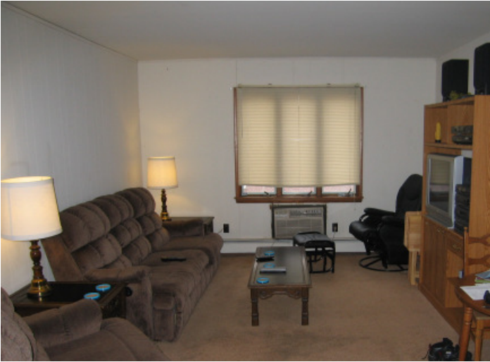
DWELLING UNIT-LIVING ROOM