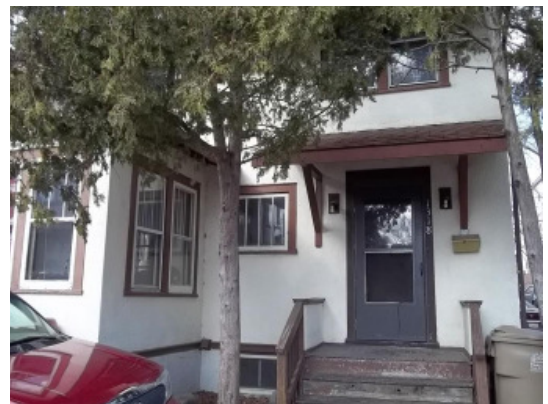
Entry at Randall Court