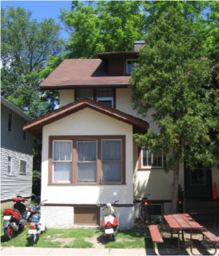
Randall Court Elevation