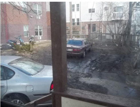
Parking at Randall Court