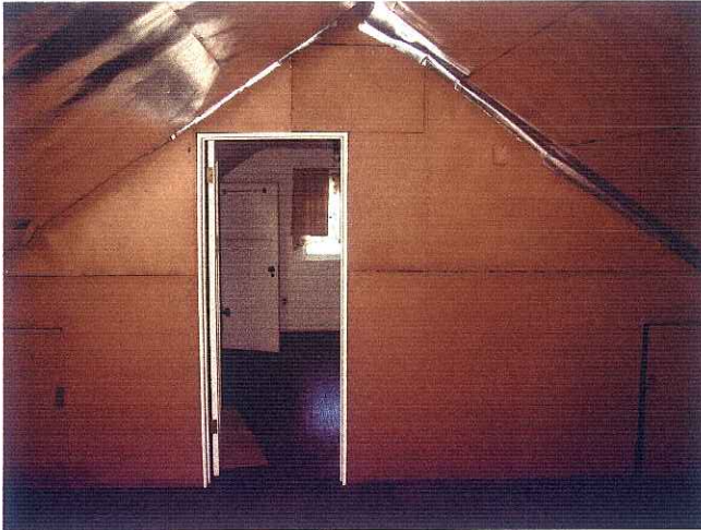
Entrance to finished 2 nd bedroom (2 of 2) through unfinished attic