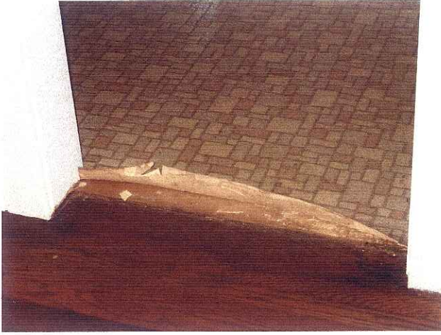
General state of disrepair