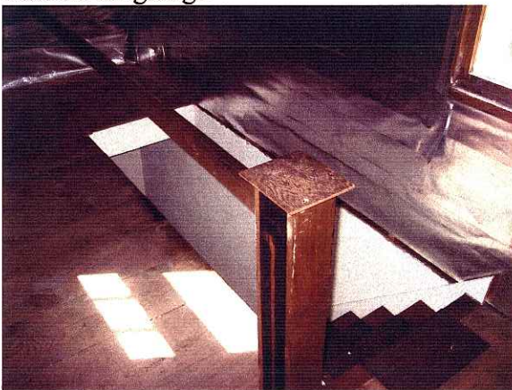
Stairwell out of code to second bedroom