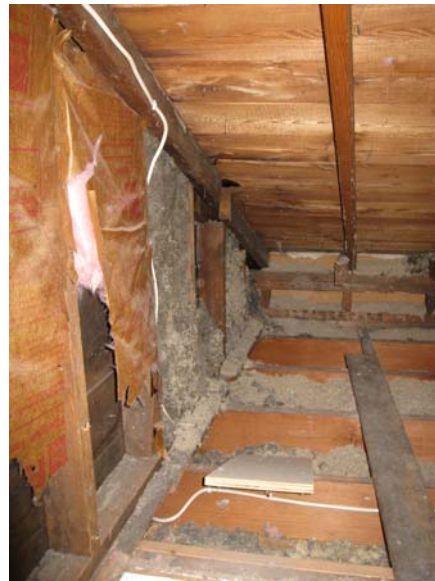
Limited insulation/chewed insulation within the attic