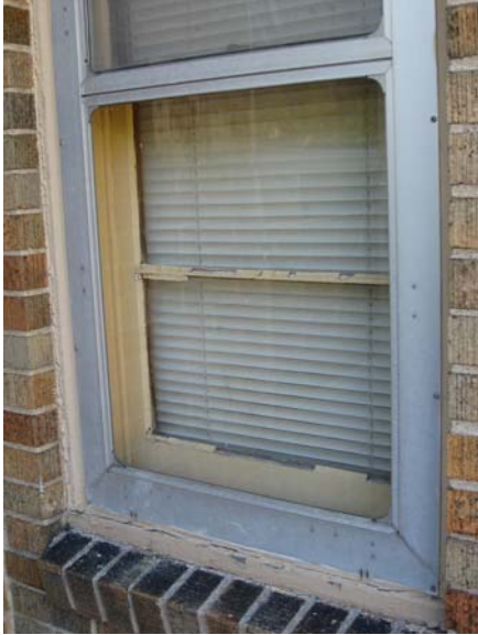
Deterioration of wood trim and caulking at masonry interface

The single pane windows and storms are in poor condition. Most windows were difficult to open, or non-operable, in their current condition. Within the interior of the home there is noticeable cracking and blistering in the plaster; this would suggest water issues in some cases as mentioned earlier. The remainder of the plaster cracking is from typical settling, but would need to be cleaned and recoated. Issues of moisture in the kitchen and bathroom were noticed with the flaking and peeling of finishes on the ceiling and walls.