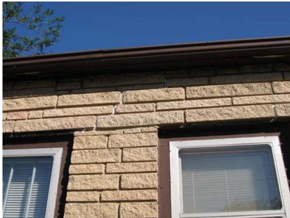
Caulking within mortar joints to attempt to repair cracking