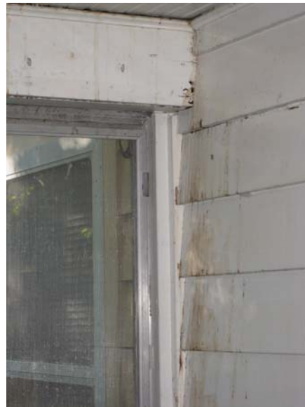
Water staining at back porch