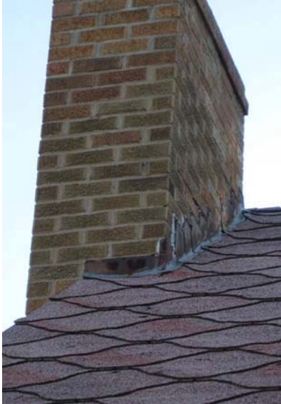
Caulk failing between flashing and masonry and flashing and asphalt shingles