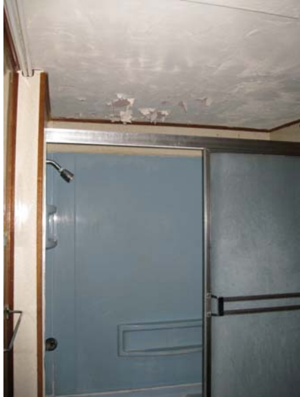
Peeling paint on bathroom ceiling