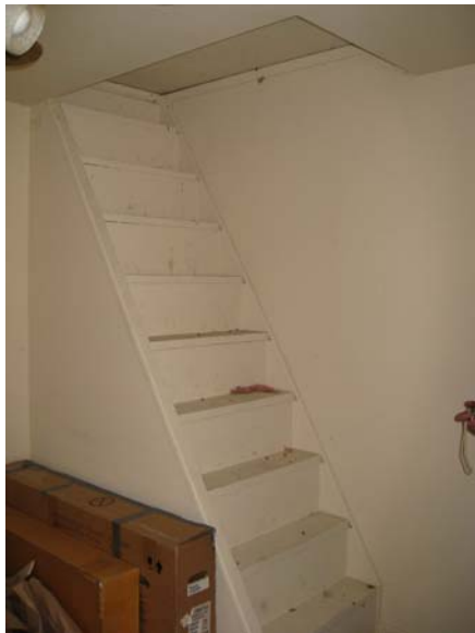
Non-code compliant stair to attic; would have to be removed or renovated

Throughout the house cracking and chipping has occurred in the plaster from typical settling of the house. A non-code compliant stair was located in the center of the home that led to unfinished attic space. Limited insulation was found in the attic, and the smell of feces was very noticeable. Areas of the limited insulation appeared to have been chewed; expected with the number of holes in the eaves on the exterior.