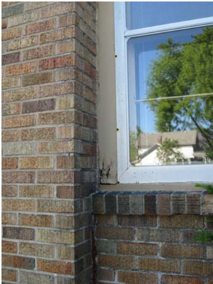
Rot of window trim and deterioration of masonry/masonry interface

The wood siding and masonry appeared to be in generally good condition. The issues appear where either interface with each other, the roof, or opening conditions. At these conditions there is noticeable rot of wood trim.