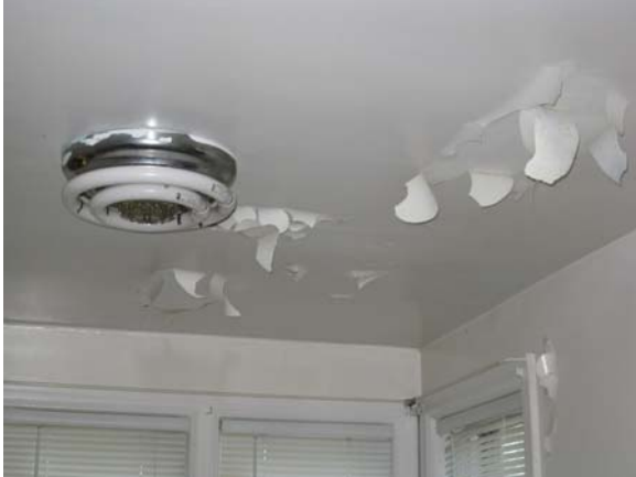
Peeling paint on ceiling and wall in kitchen

Electrical and mechanical systems are outdated and will need to be removed and replaced with up to date systems.