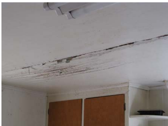
Water damage in kitchen ceiling