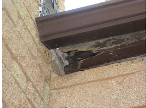
Rot at wood eave/masonry interface