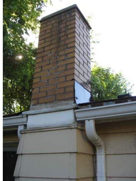
Water staining and attempts to correct at masonry chimney and metal siding interface