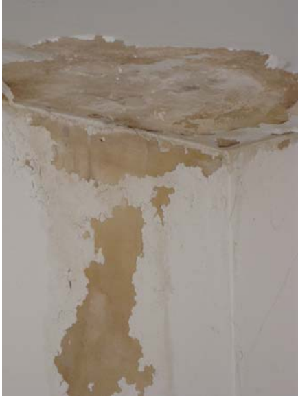
Water staining and deteriorated ceiling and wall plaster in back bedroom

The wood siding and masonry appeared to be in generally good condition. The issues appear where either interface with each other, the roof, or opening conditions. At these conditions there is noticeable rot of wood trim.