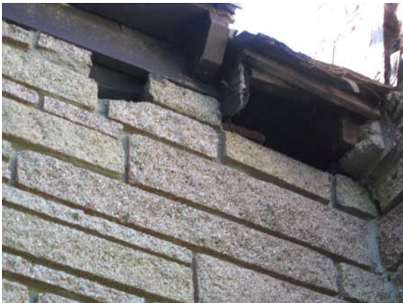
Rot and noticeable openings in eaves