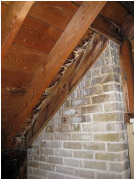
Water staining on roof sheathing and masonry at chimney