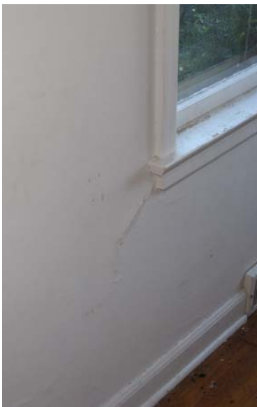
Blistering and cracking of plaster at window in living room

The single pane windows and storms are in poor condition. Most windows were difficult to open, or non-operable, in their current condition. Within the interior of the home there is noticeable cracking and blistering in the plaster; this would suggest water issues in some cases as mentioned earlier. The remainder of the plaster cracking is from typical settling, but would need to be cleaned and recoated. Issues of moisture in the kitchen and bathroom were noticed with the flaking and peeling of finishes on the ceiling and walls.