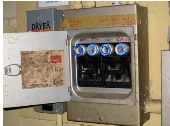
Outdated electrical system (no ground at the outlets)

The issues discussed above and the size of the home make it economically unfeasible to relocate this home to another site. A home of identical size and layout would be less expensive to build new than to move this existing home to a new lot and construct a new foundation and make all of the necessary updates. It is our recommendation to demolish and recycle the existing home at 159 Proudfit.