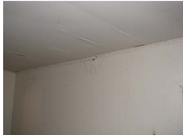
Water damage on ceiling and wall within bedroom