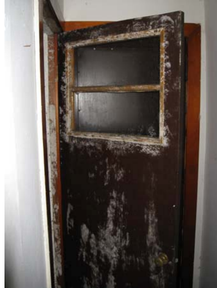
Mold on door leading to basement