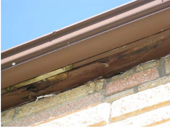
Rot at wood eave/masonry interface