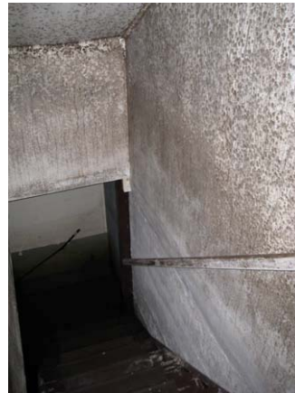
Mold throughout walls leading down to basement/water filled

With the problems listed above and the size of the home, it is our recommendation that the home at 167 Proudfit Street be demolished and any items not destroyed, or affected, by the mold be recycled if possible.