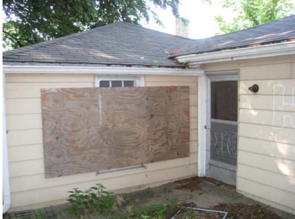
Damage to metal siding and detail of siding continuing below grade