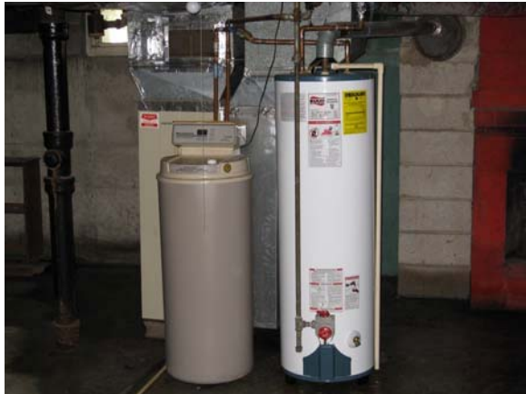
Mechanicals in basement

The basement had noticeable signs of water entering the building from the concrete foundation walls and running directly in to the floor drain; staining was prevalent. The mechanicals were not running, but appeared to be in good condition.