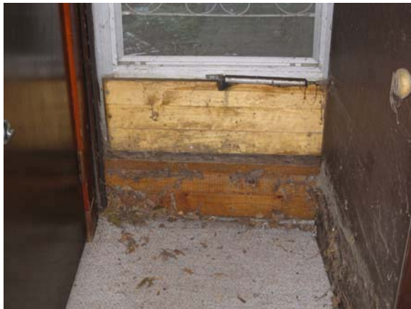
Floor elevation in home is 10" below outside grade