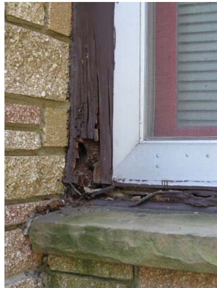
Rot and insect damage at wood window trim