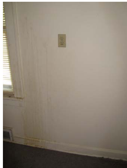
Water staining on wall around window