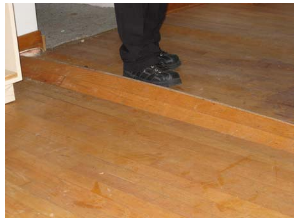
Swollen hardwood floors in main room