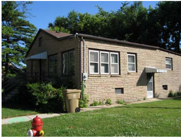
Photo of existing home at 171 Proudfit Street

The home is approximately 1,273 sq.ft. and clad with an architectural concrete masonry system on the walls and asphalt shingles on the roof. Single pane windows with aluminum framed storm windows cover the openings. The exterior concrete masonry appears in good condition with the exception of some tuck pointing to the mortar with caulking. The main issues with the exterior are found at the eaves of the roof and the wood trim. In both cases there are numerous areas of rot and noticeable holes within the two areas mentioned. Animal infestation was confirmed when we opened the attic to the smell of animal /bat feces.