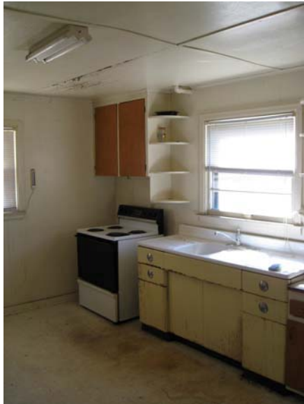
Sagging ceiling and water damage in kitchen ceiling/water on the floor

The rotting and deterioration of the roof and eave system has led to noticeable water damage within the home. The kitchen had a standing puddle of water on the floor and the painted wood panel ceiling was sagging from water damage. Other areas throughout the bedrooms have noticeable sagging in the wood panel ceiling as well as staining on the walls.