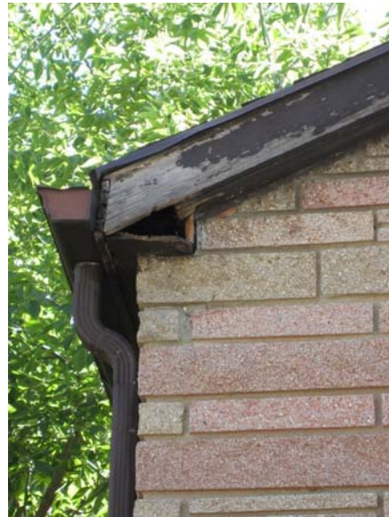
Rot and noticeable openings in eaves