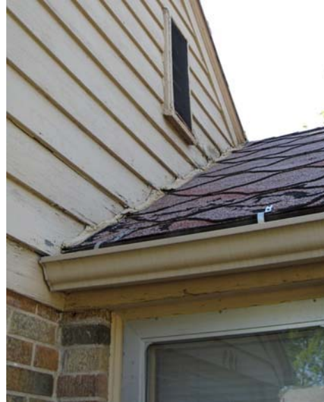
Deterioration of caulking and missing flashing at front porch roof interface with exterior wall