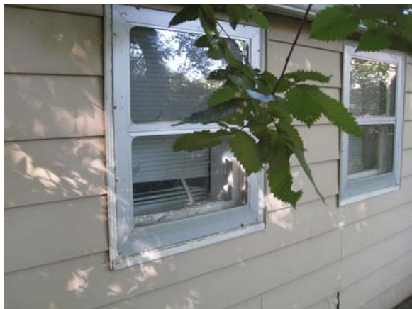
Broken/non-operable single pane window and storm