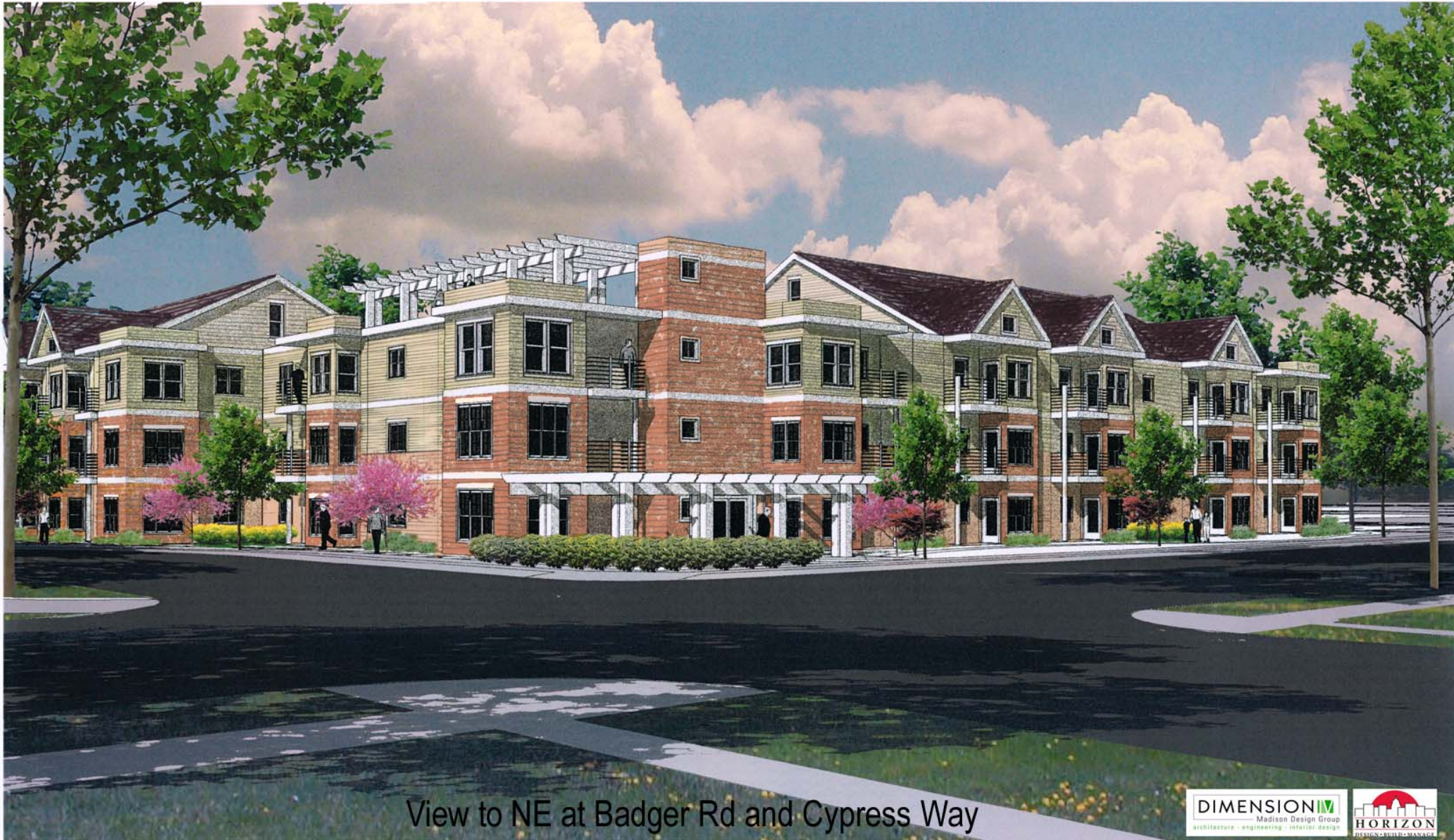
View to NE at Badger Rd and Cypress Way