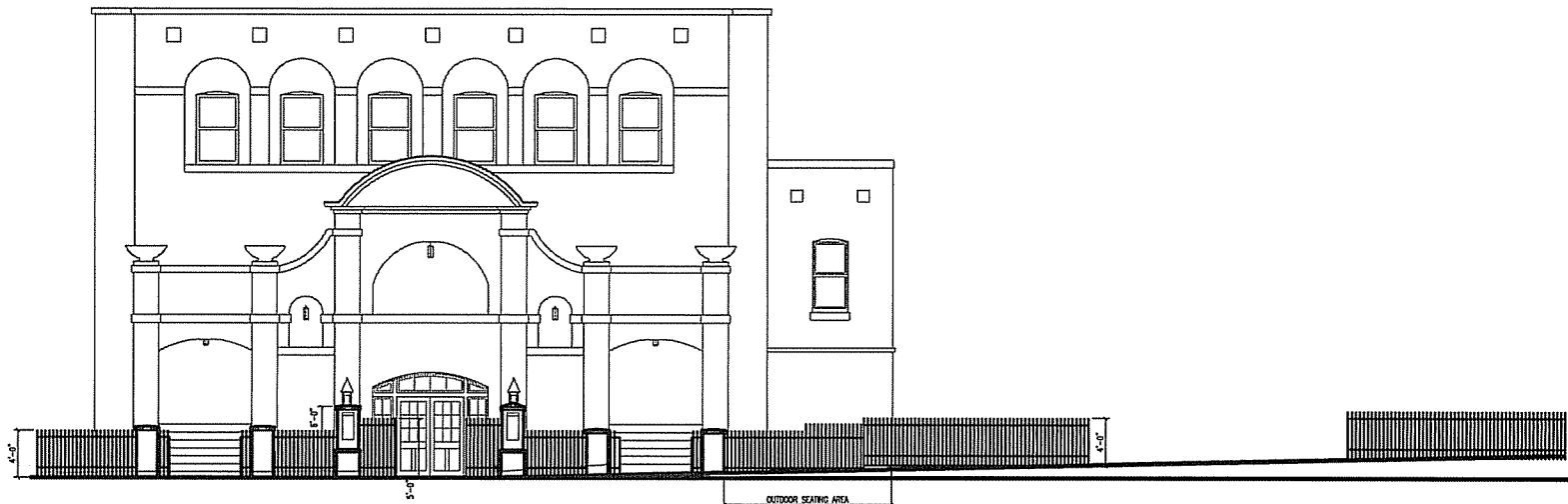
1 FRONT ELEVATION AT OUTDOOR SEATING AREA \frac{3}{32}'' = 1'-0''