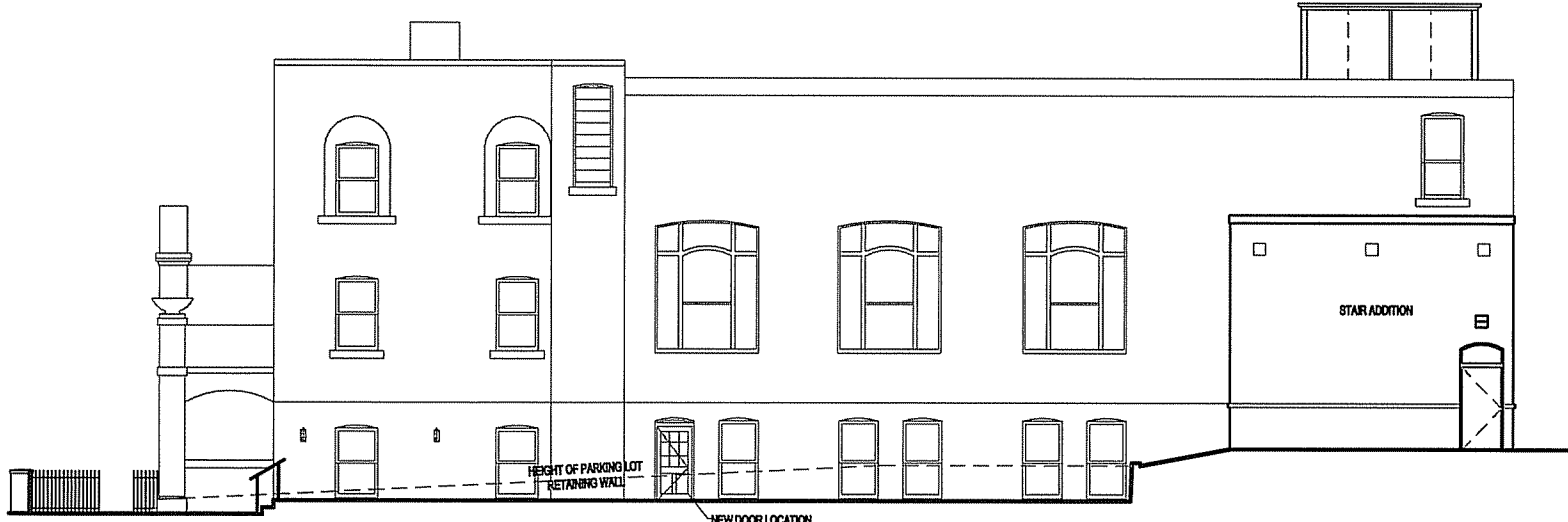
2 SIDE ELEVATION AT OUTDOOR SEATING AREA \frac{3}{32}'' = 1'-0''