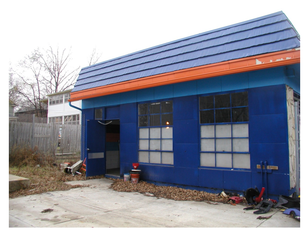
East Side of Building