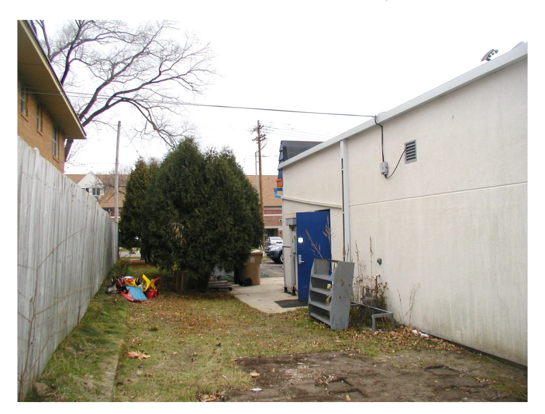
South Backside of Building