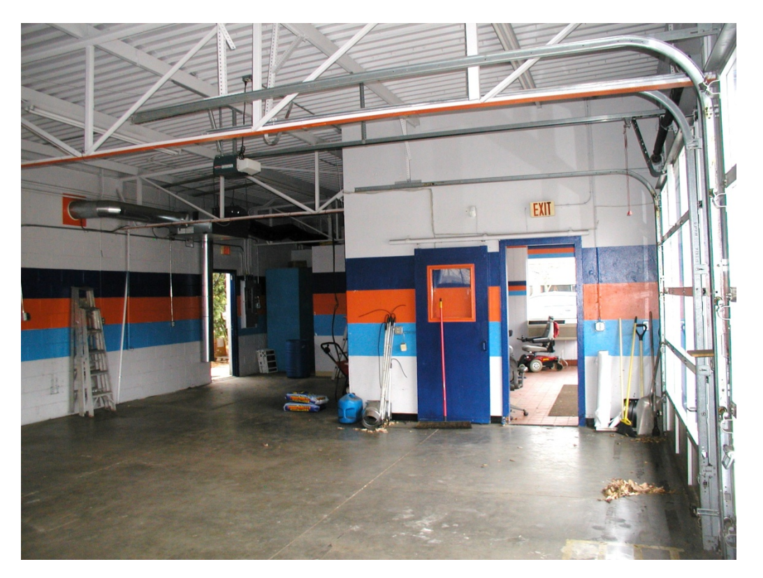
Shop Area Interior of Building