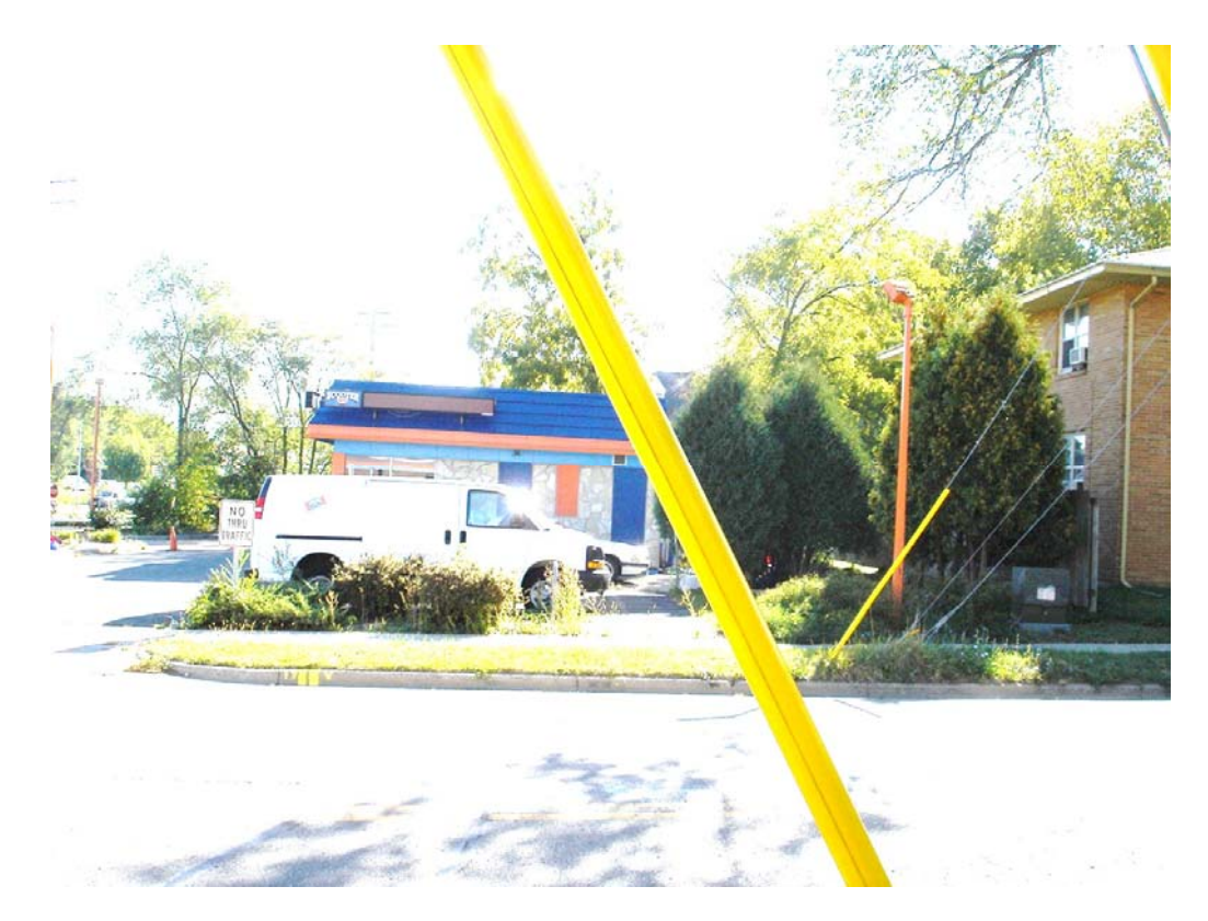
W Side of Site to Building