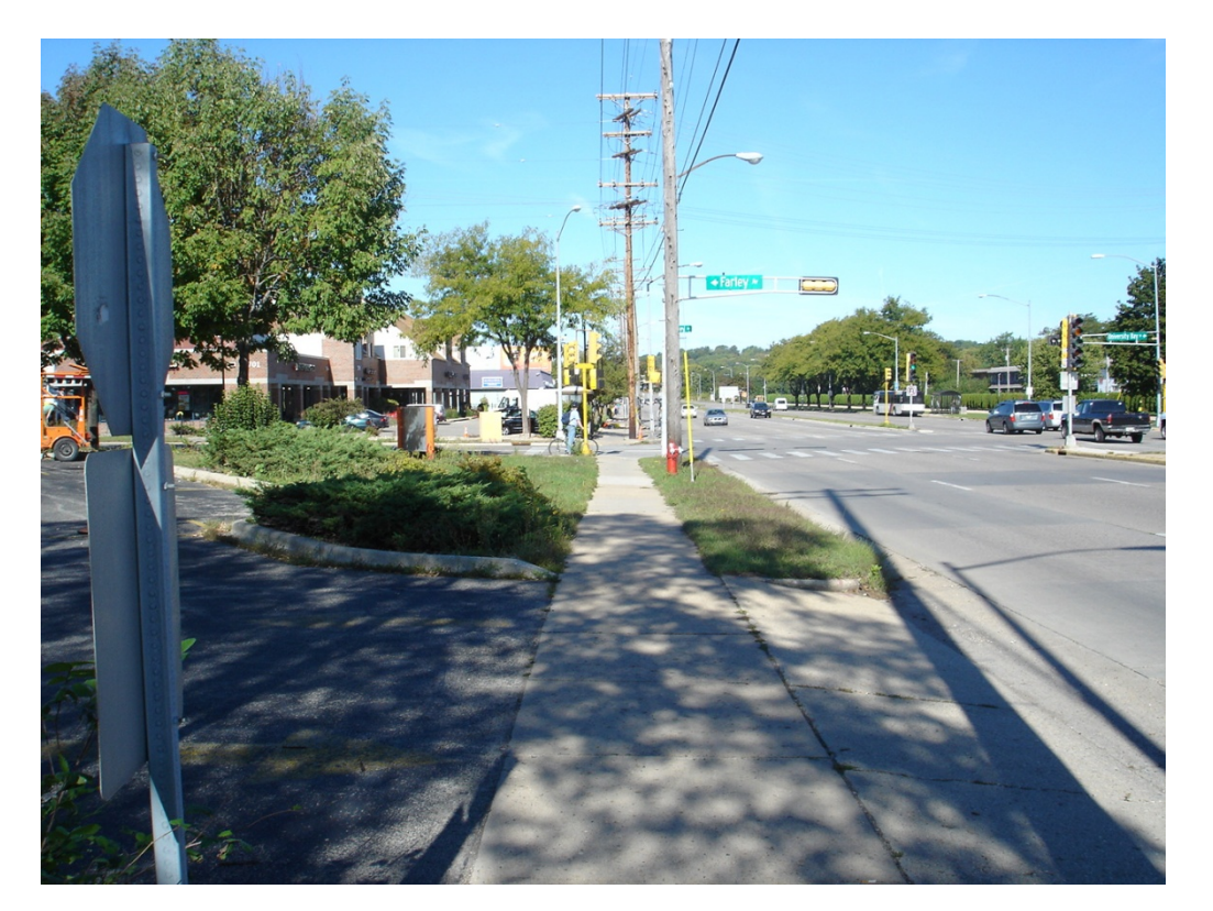
NE Corner of Site to the West