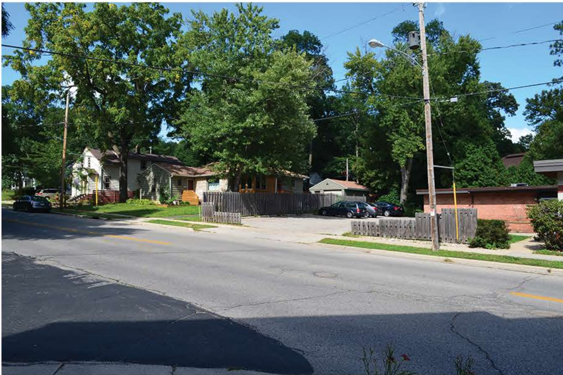
View of Residential up Glenway Street from site