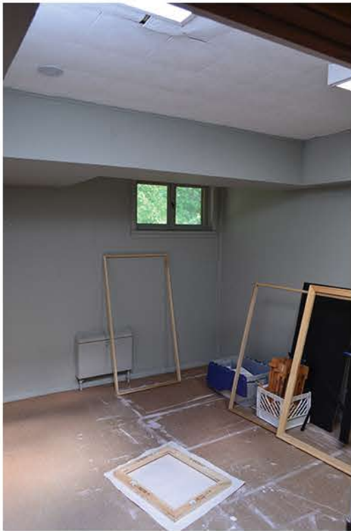
Existing Office Area within original building