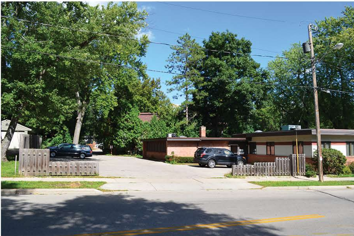
Existing Building parking accessed off of Glenway Street