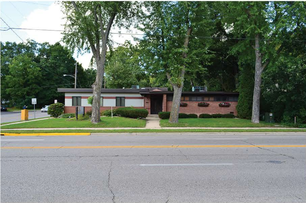
Existing Building along Monroe Street