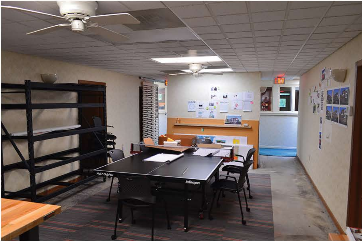
Existing Area within the building addition