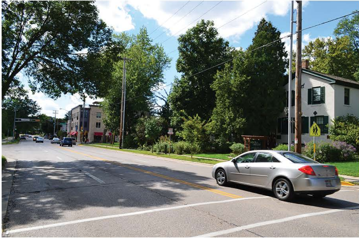
View along Monroe Street from the East