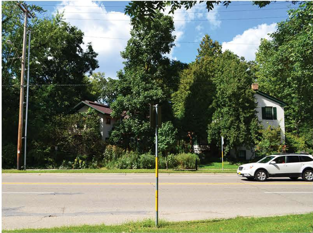
Arbor House to the east of property along Monroe Street