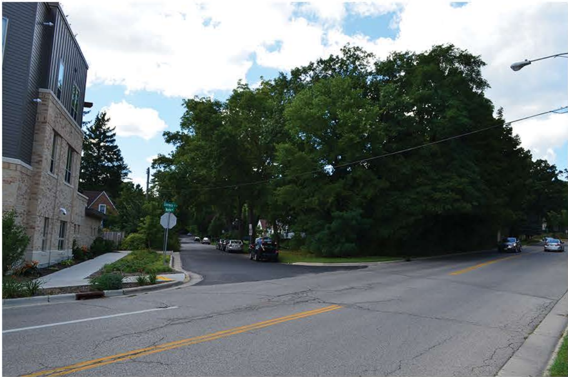
View from site looking up Wyota Avenue