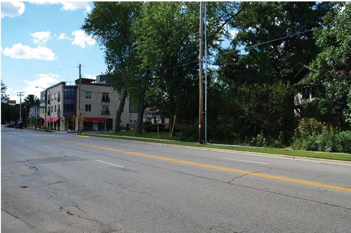
Existing Tree Line Along East Edge of Project Site