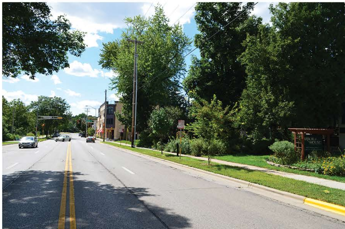
Oblique View of Adjacent Site and West Edge Tree Line