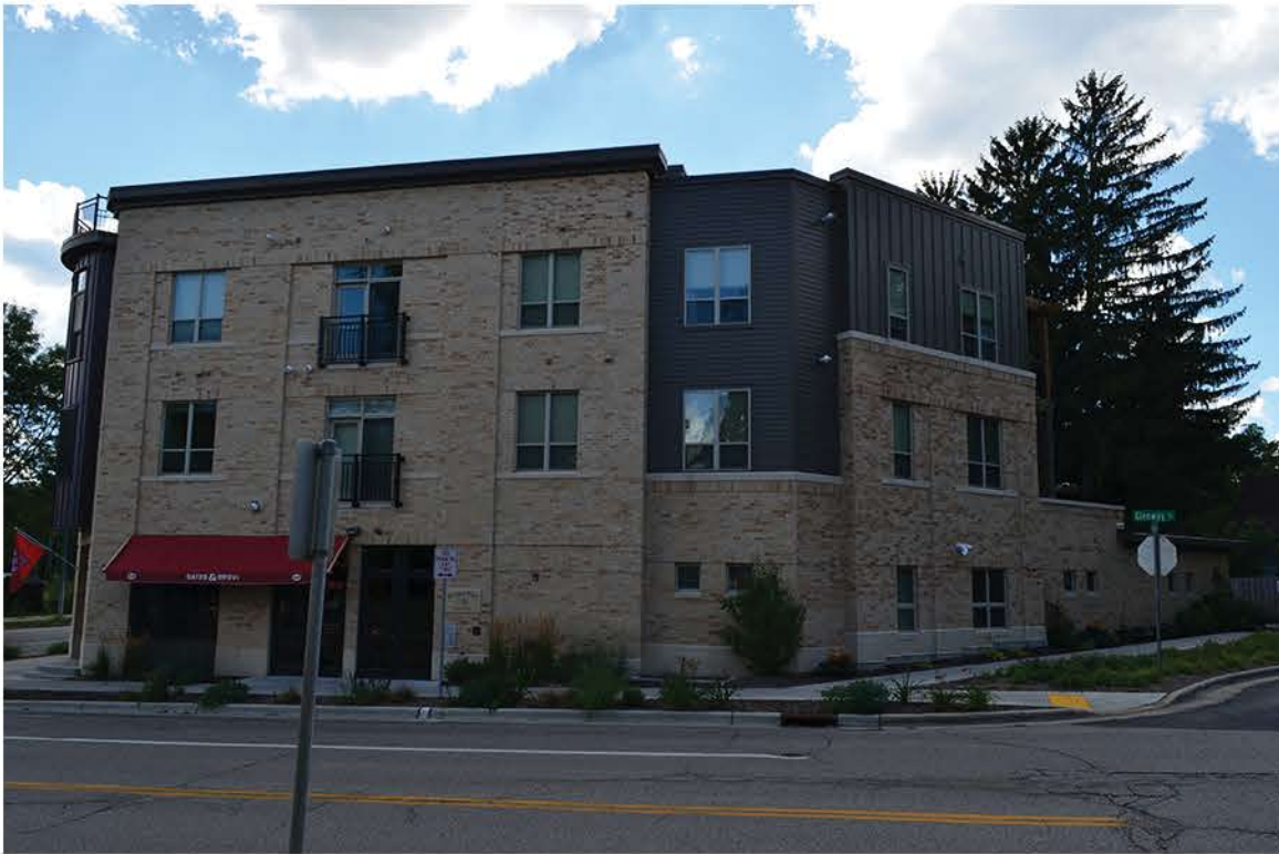
Parman Place along Glenway Street