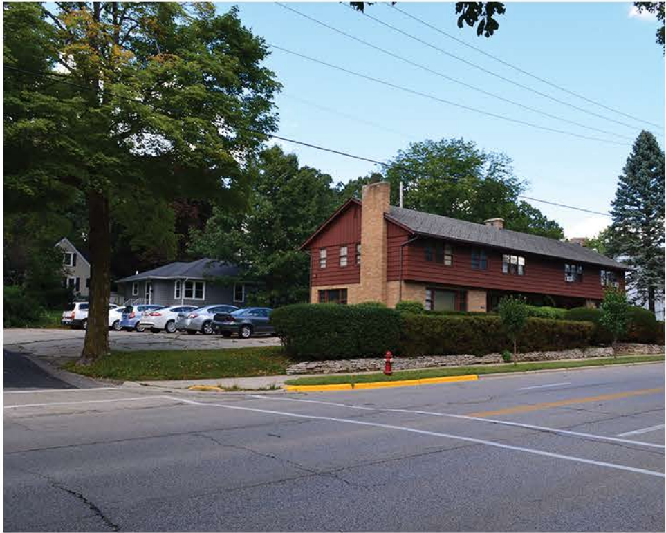
Apartments along Monroe Street east of Arbor House