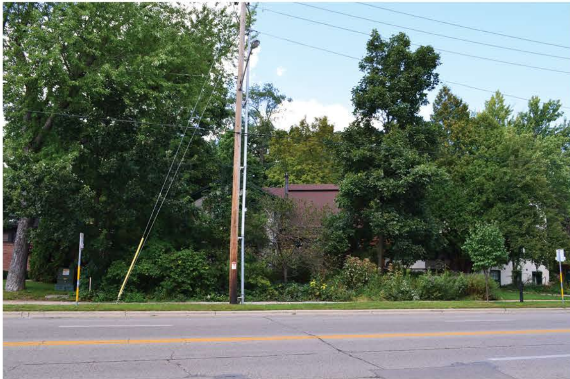
Adjacent Site / Monroe Street Elevation Along West Tree Line