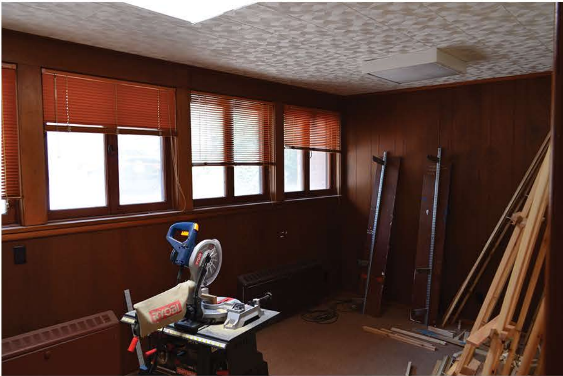
Existing Office Area within original building