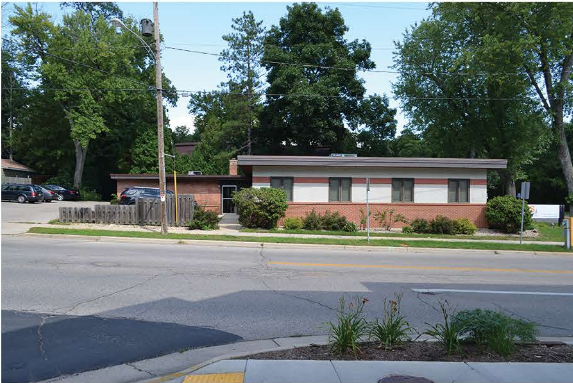
Existing Building along Glenway Street