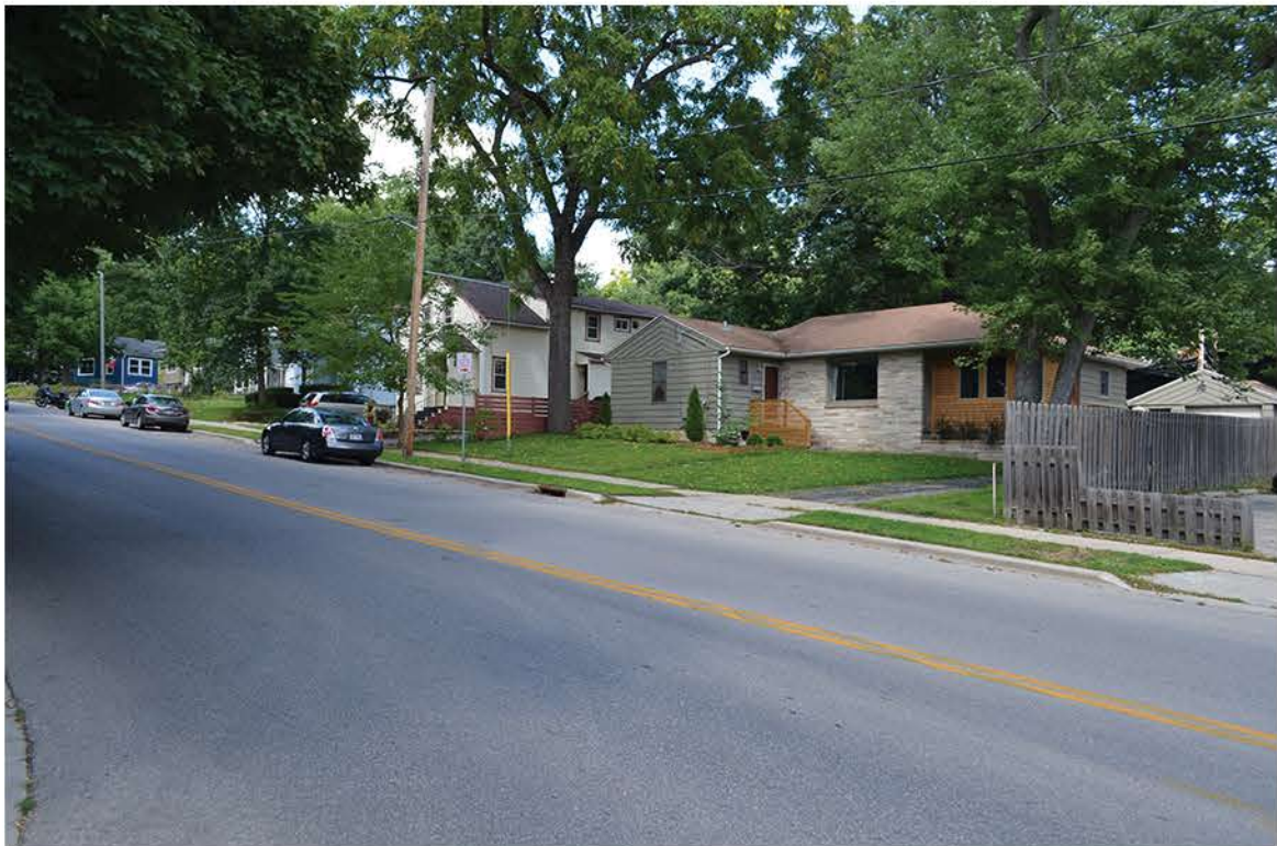
View of Residential up Glenway Street from site