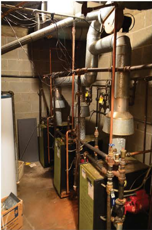
Mechanical room within original building