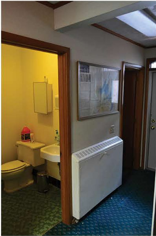
Restroom within original building