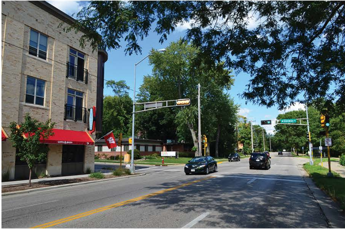
View along Monroe Street from the West