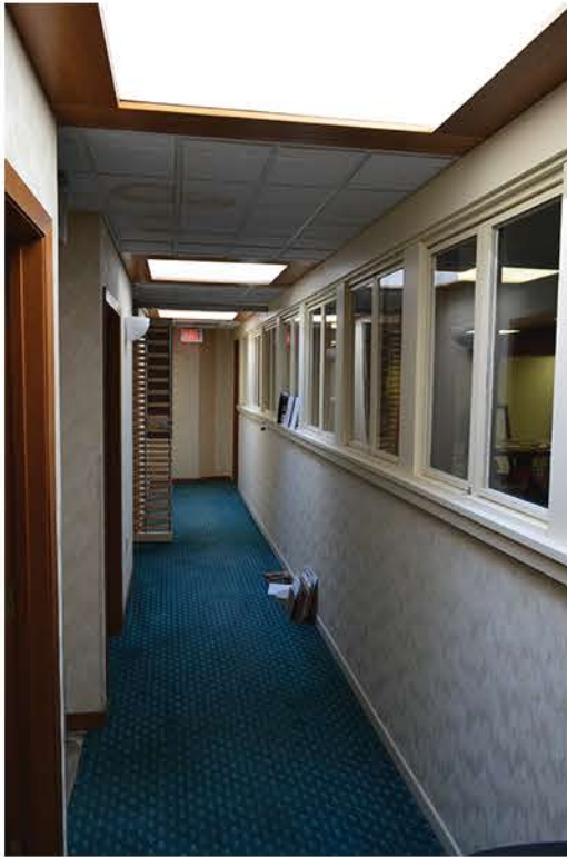
Corridor to building addition