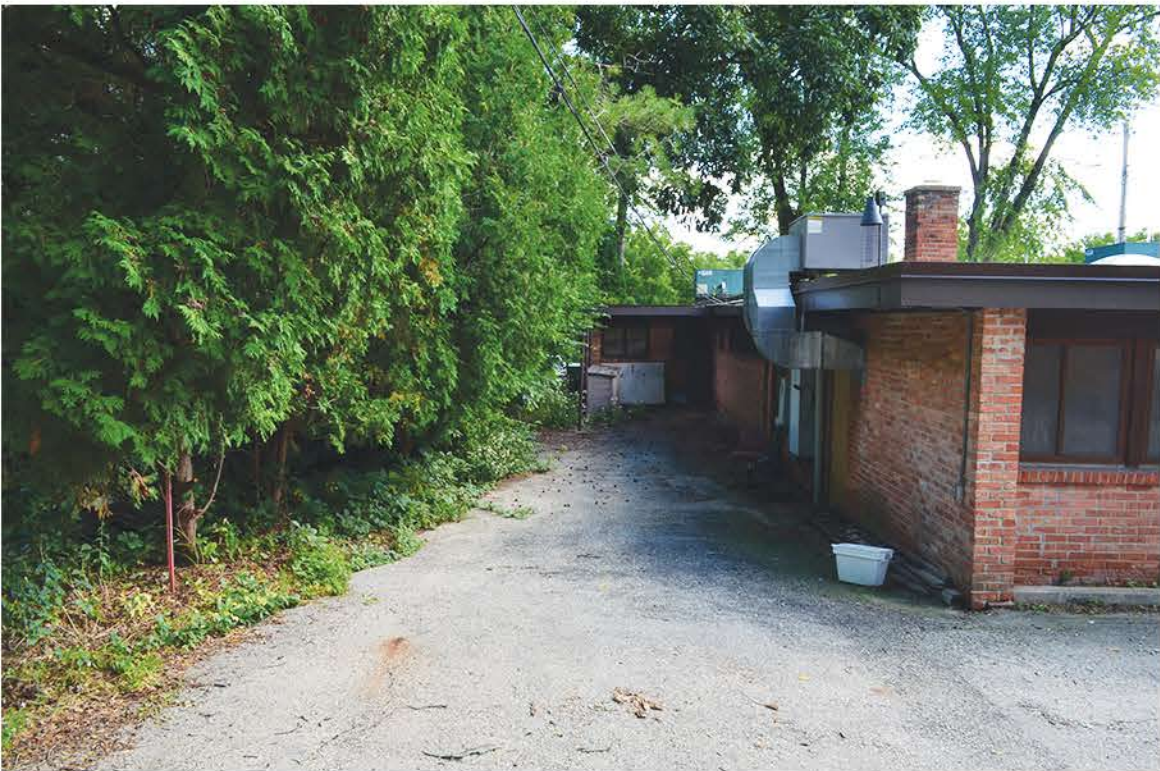
Existing Building adjacent to Arbor House property