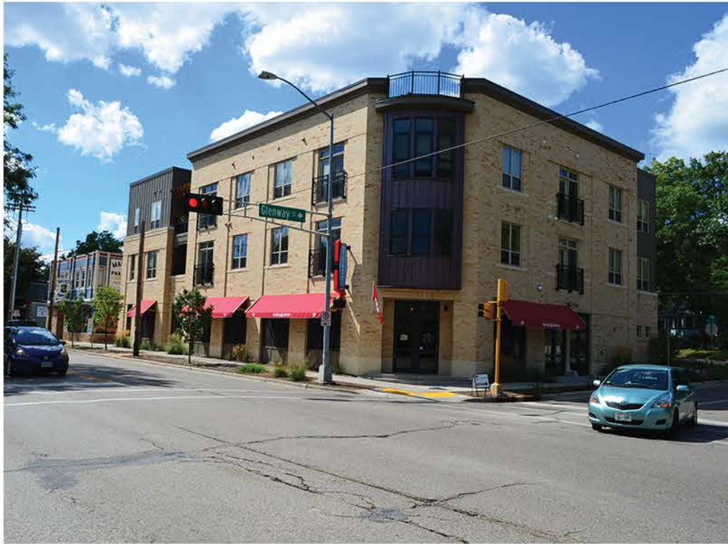
Parman Place at Glenway Street and Monroe Street