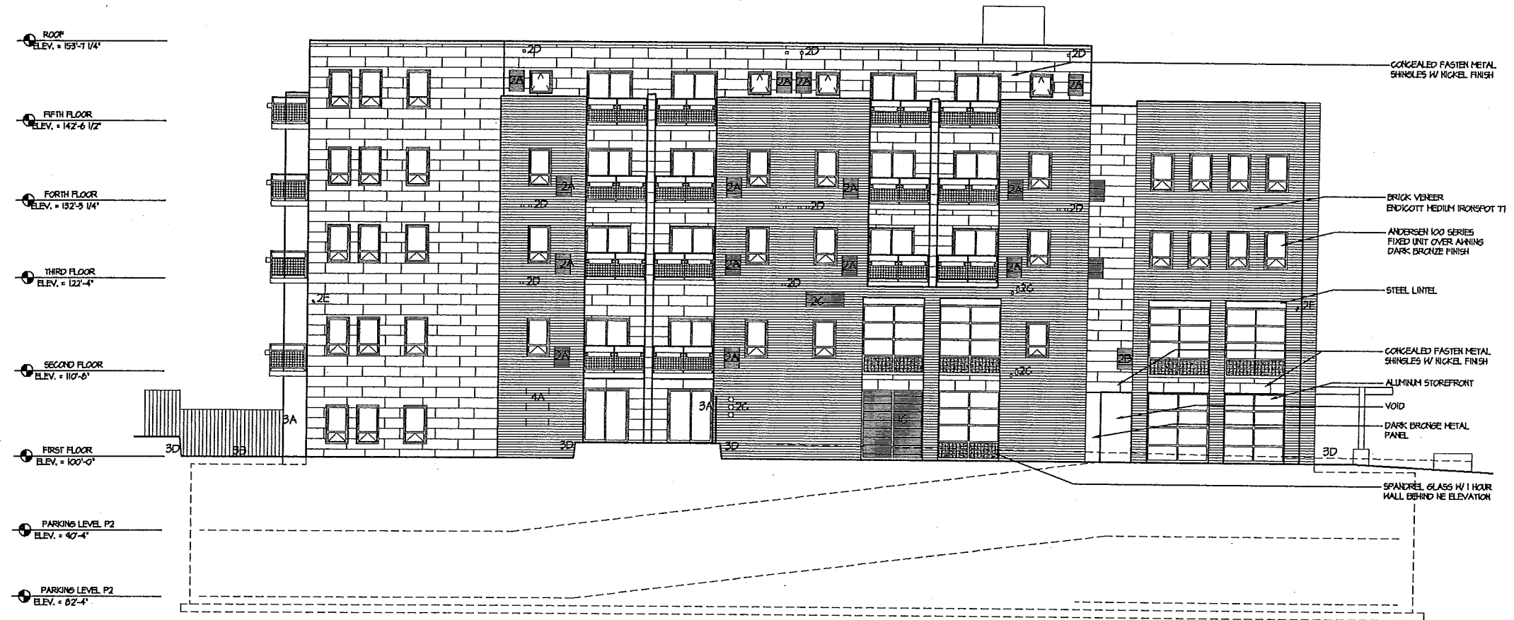
2 A2.1 NORTHEAST ELEVATION SCALE 1/8" = 1'-0"

PROJECT Washington Plaza 425 W. Washington Avenue Madison, Wisconsin 53703 DRAWING BUILDING ELEVATIONS