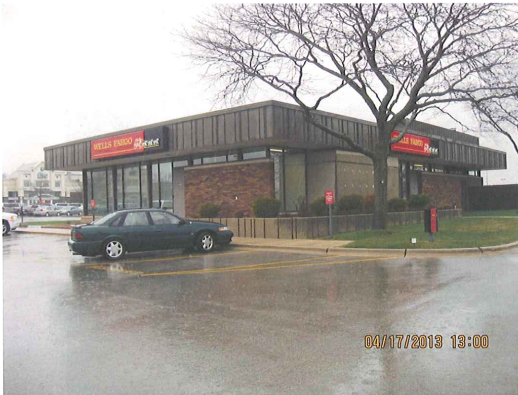
Southeast corner of existing building.