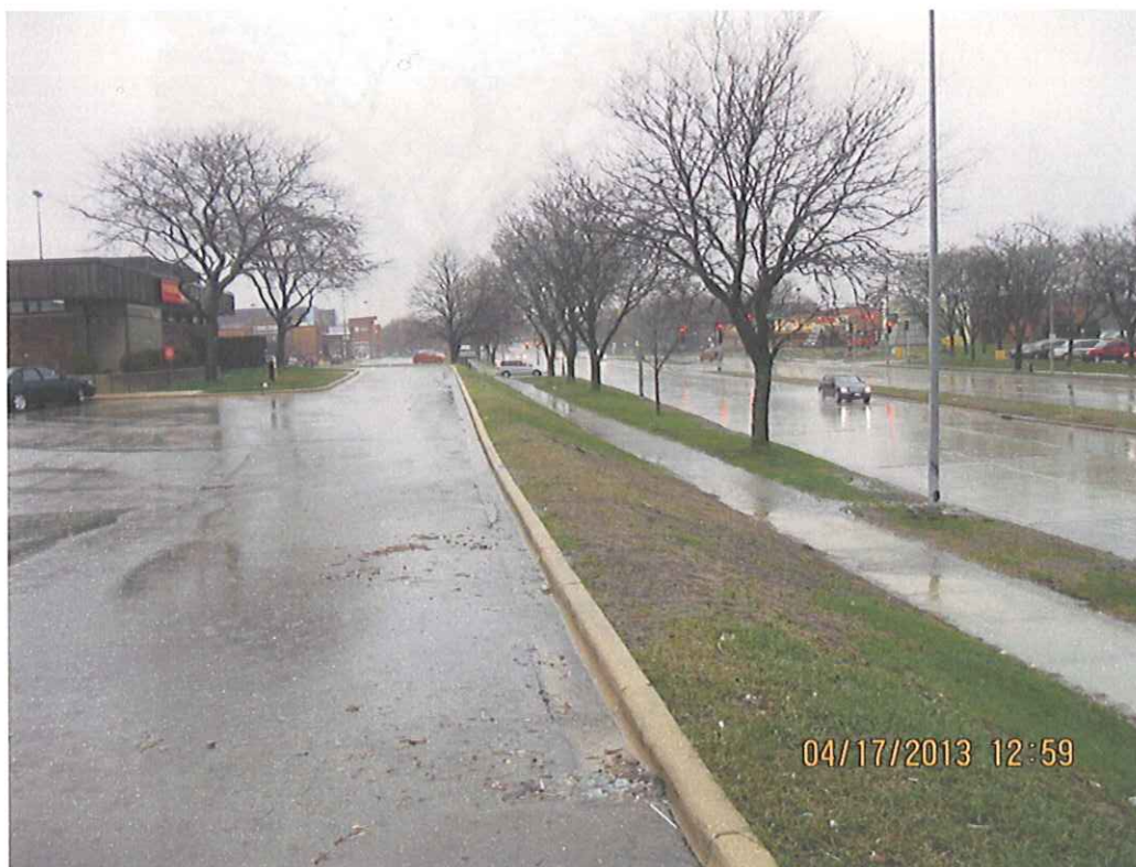
Sidewalk along Gammon Road and east of site.