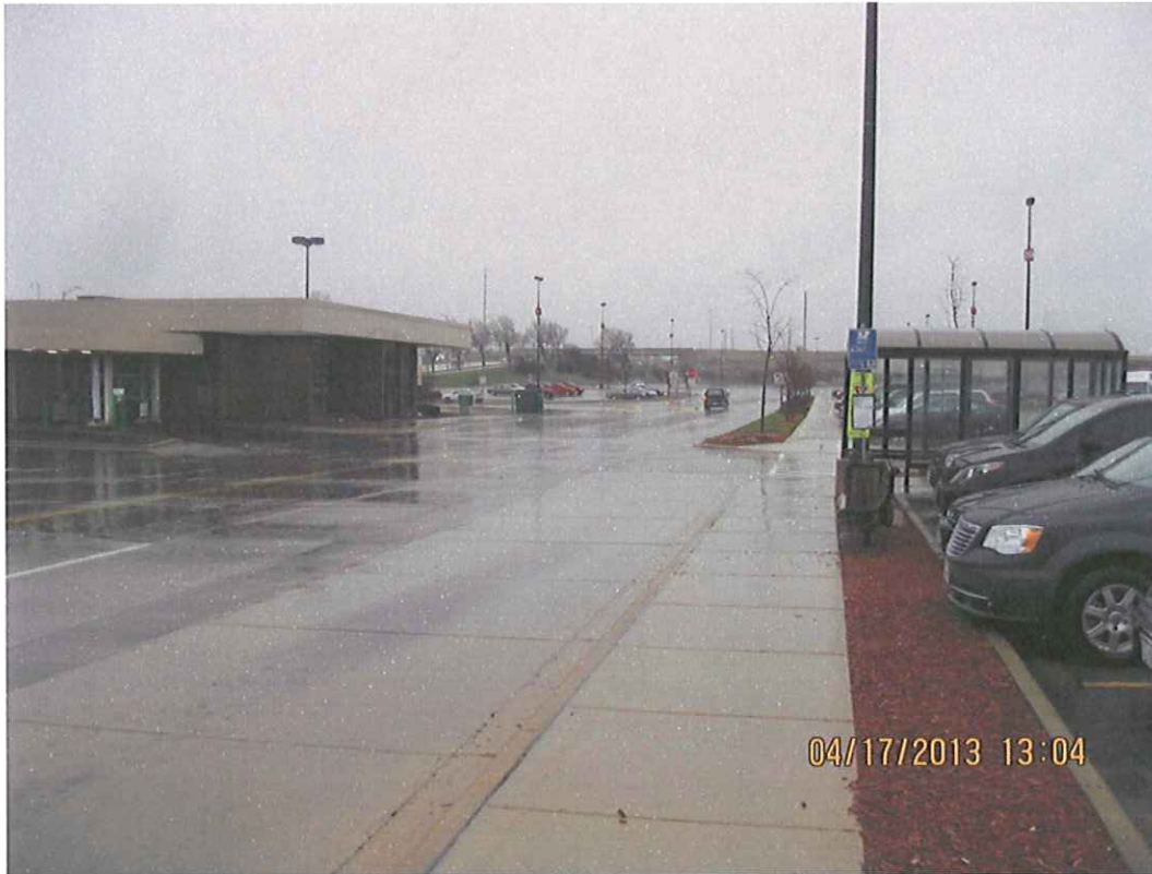
View of existing bus stop to the southwest of site.