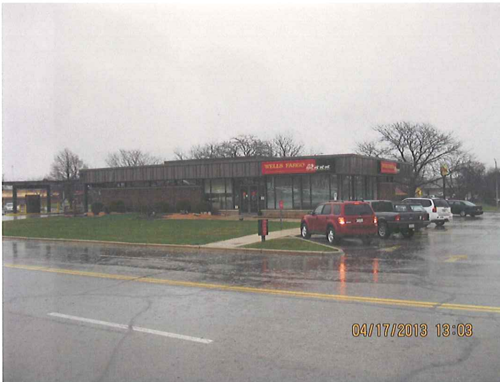
View of west side of existing building.