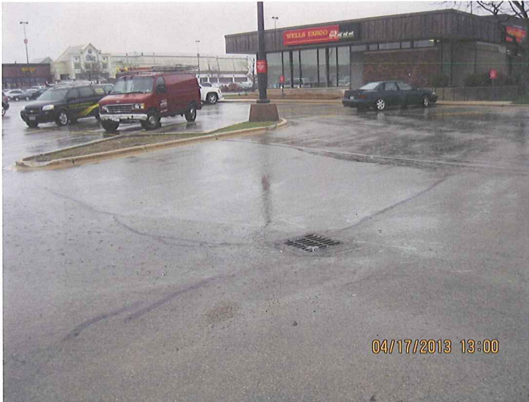
Storm inlet near center of proposed site.