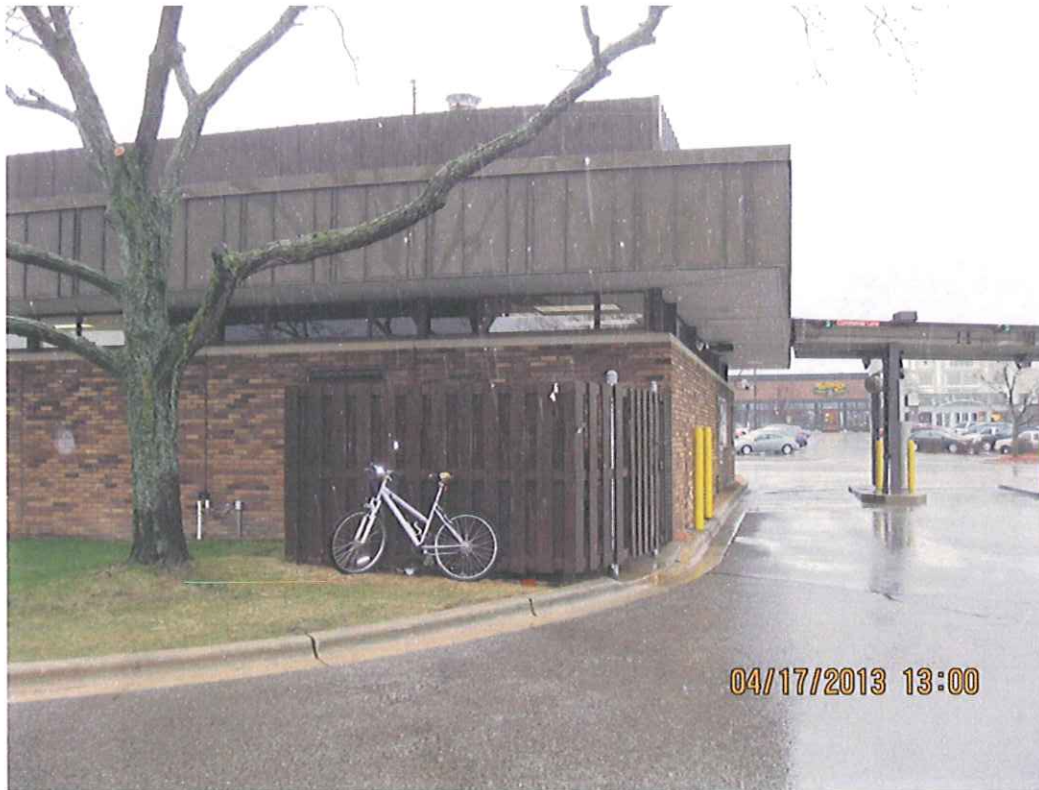
Existing dumpster enclosure and drive-thru.