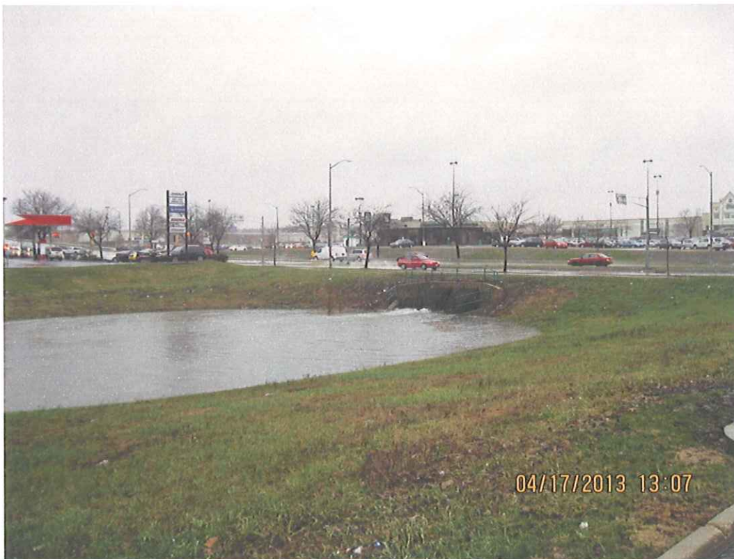
Existing detention pond east of Gammon Road.