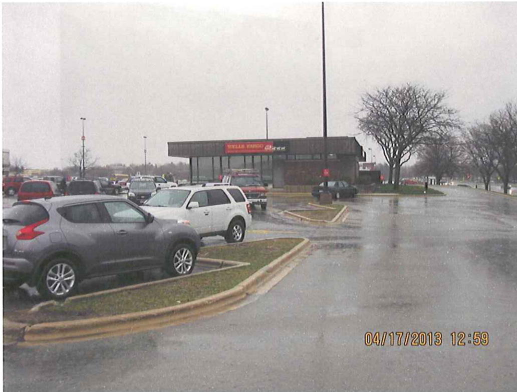
View of site from southeast corner of parking lot.