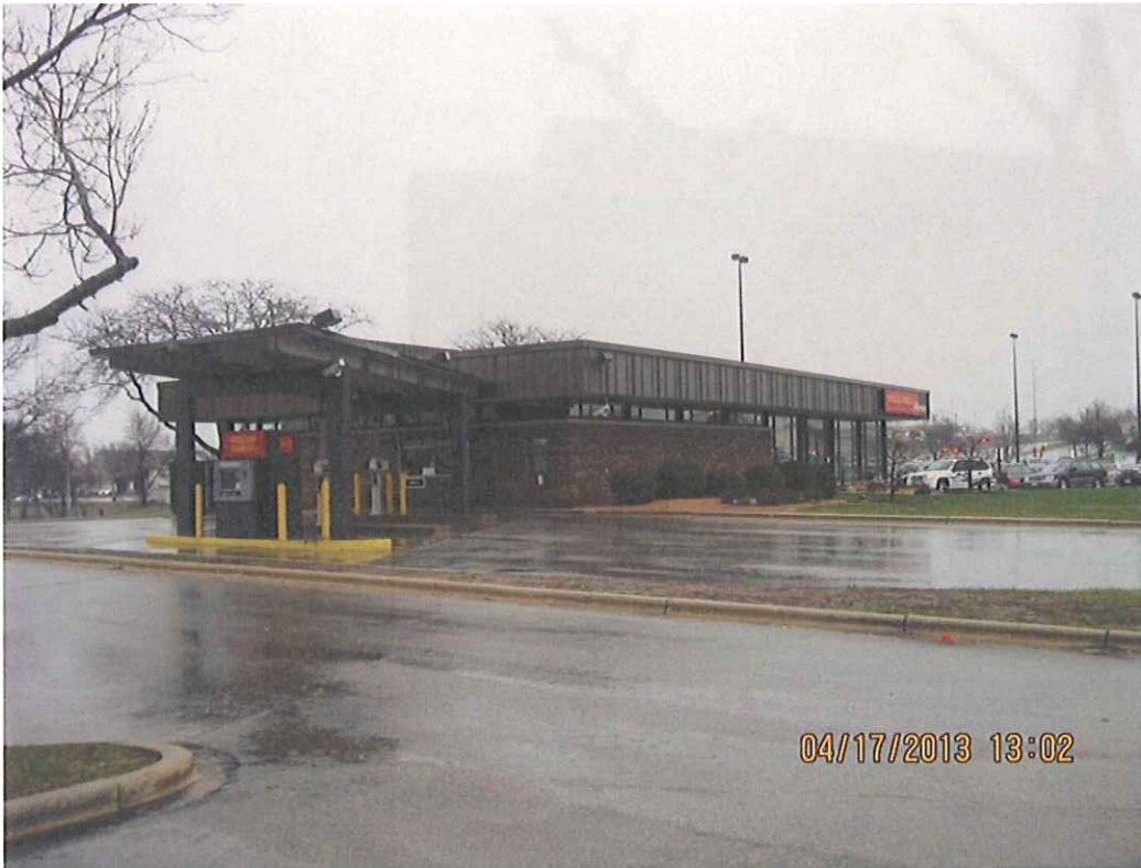
View of northwestern side of existing building and drive-thru.