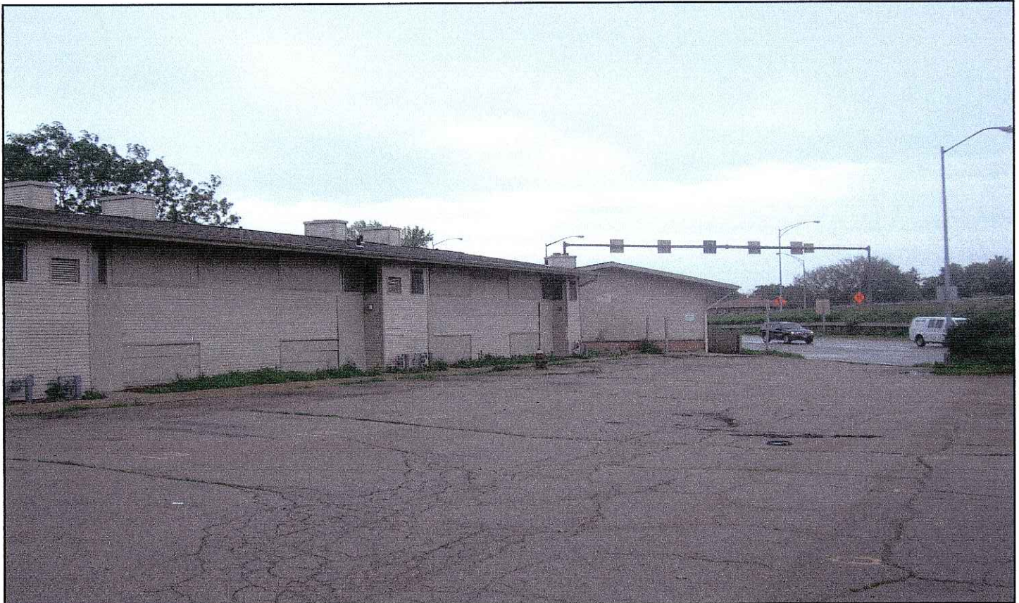
View of parking lot to be abandoned & buildings along the beltway off-ramp