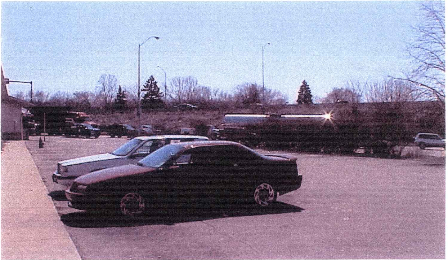
Acquired Parking Lot