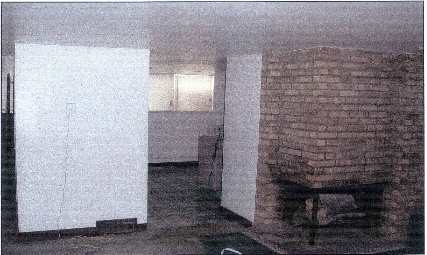
Living Room with view of kitchen