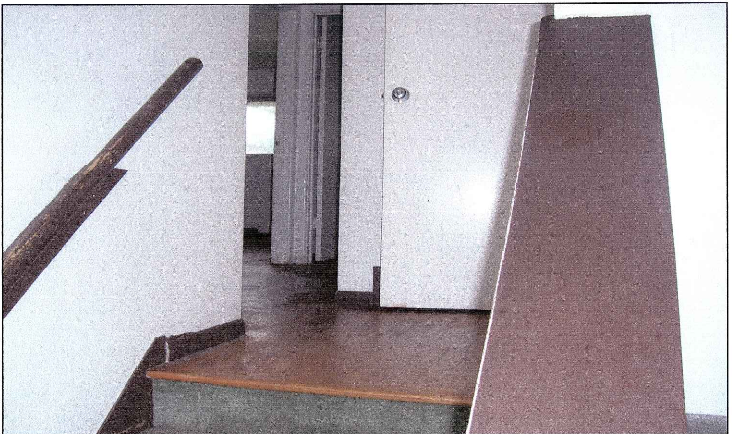
Stairway to second floor