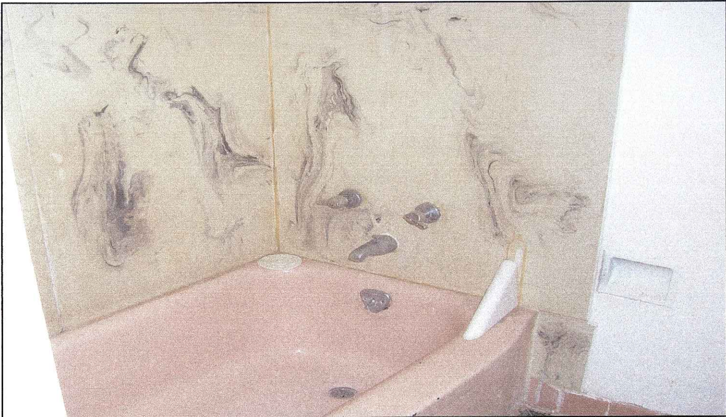
Shower over tub unit