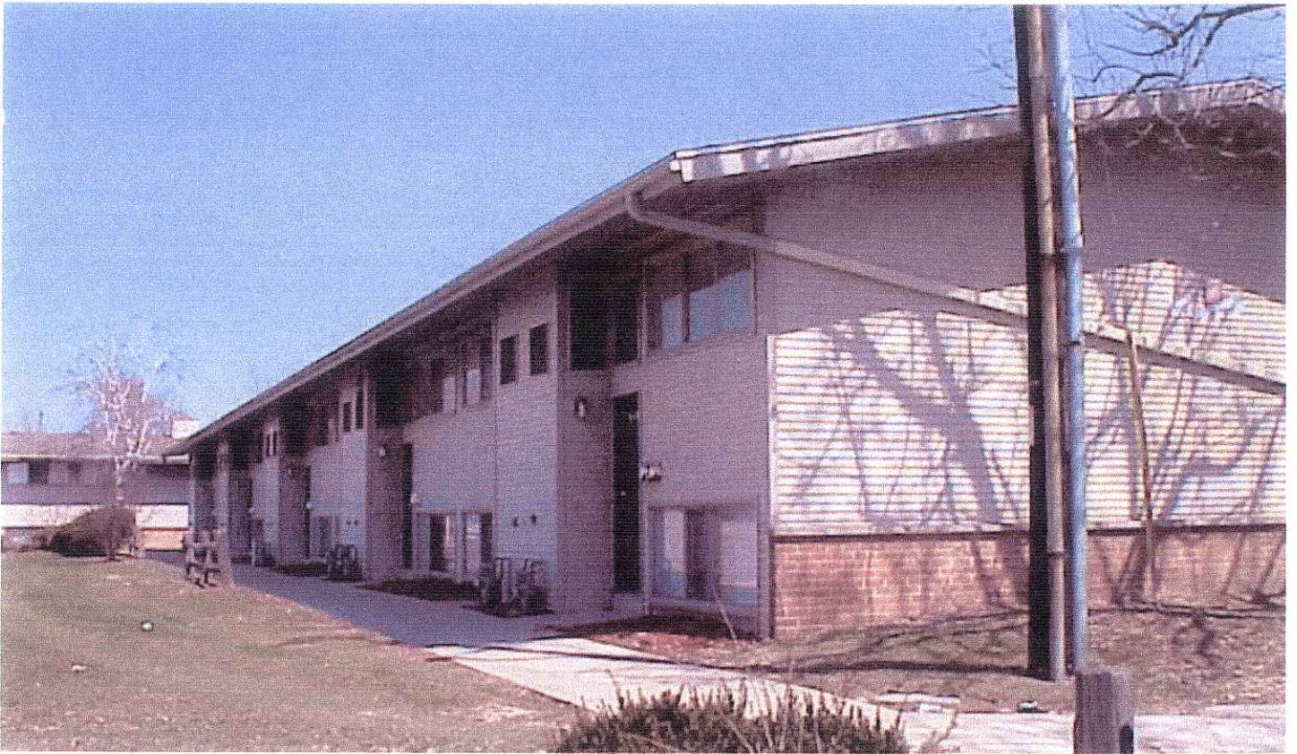
Typical Unit Design