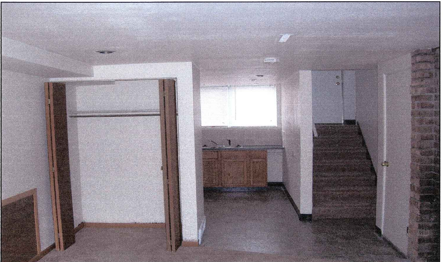
View from Living Room to kitchen & stairway