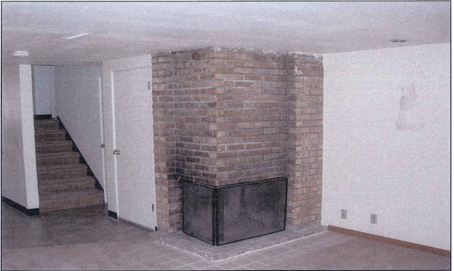
Living Room with Fireplace in a 2 bedroom unit