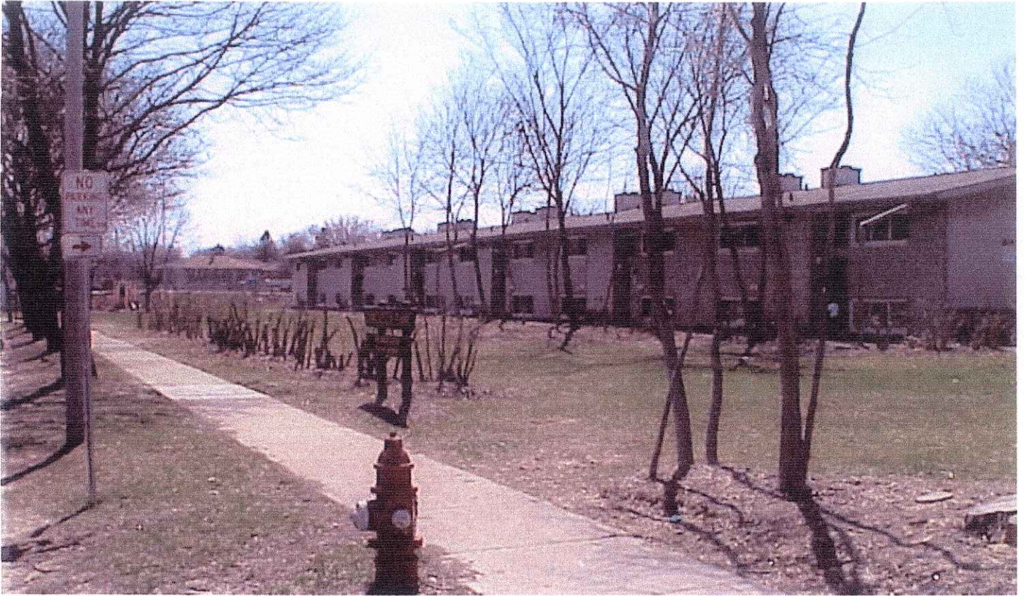
Proposed Area of Reconstructed Parking