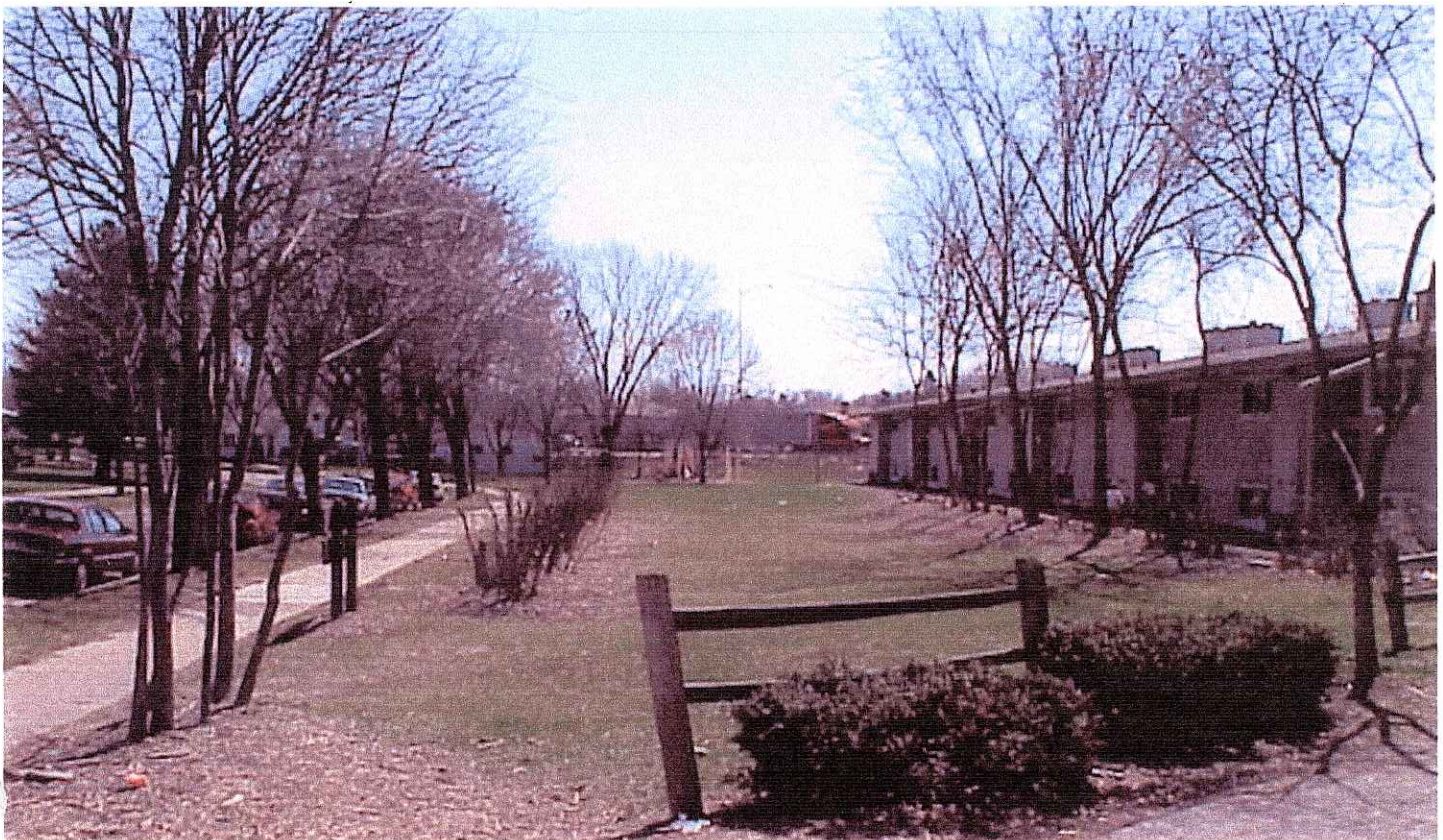
Area Proposed for Replacement Parking