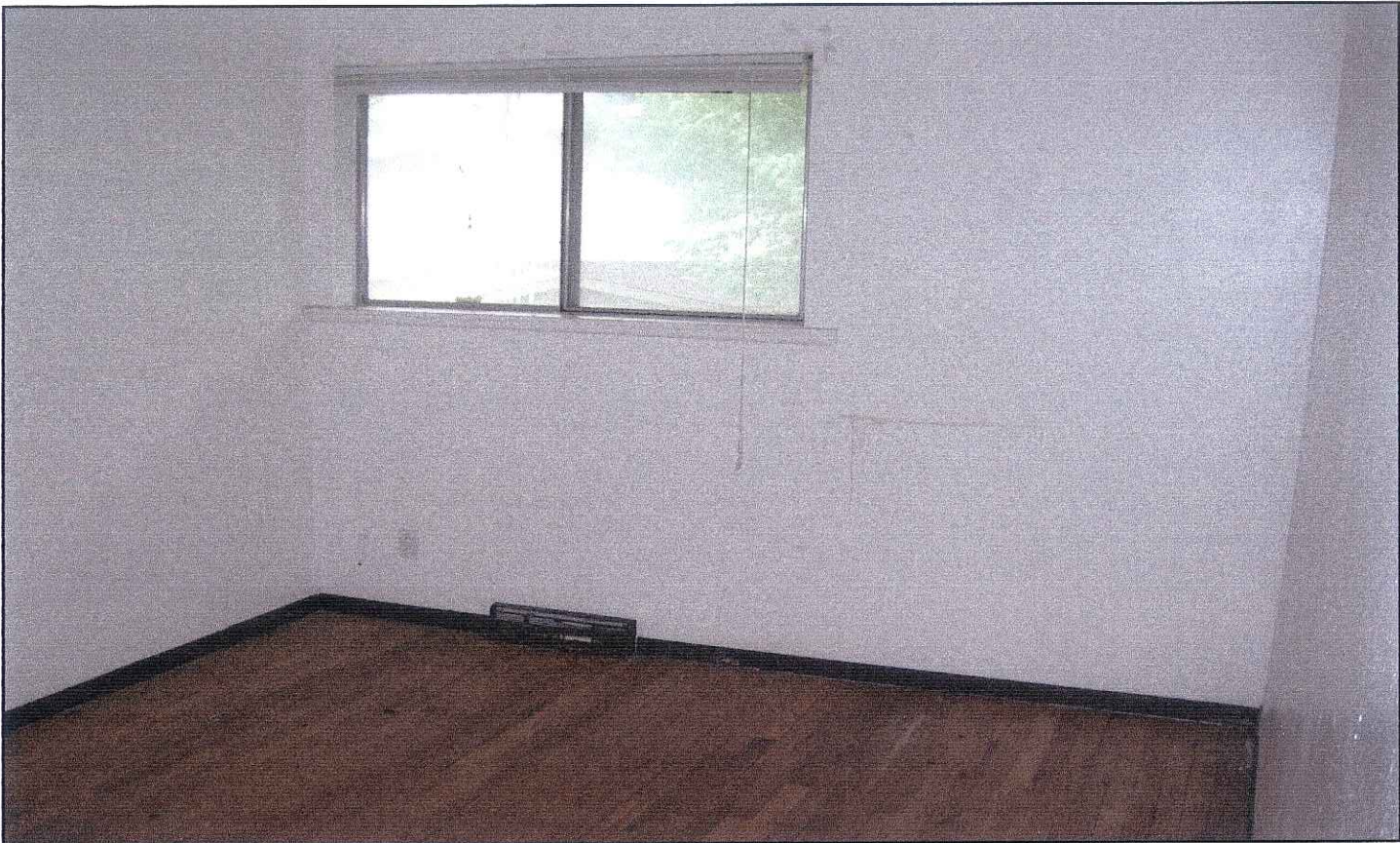
One of the bedrooms