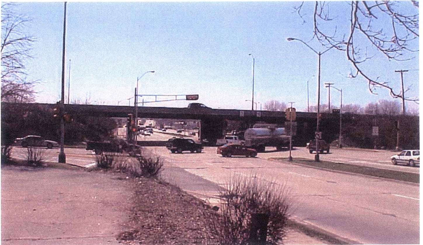
Midvale Street Frontage Facing Southwest