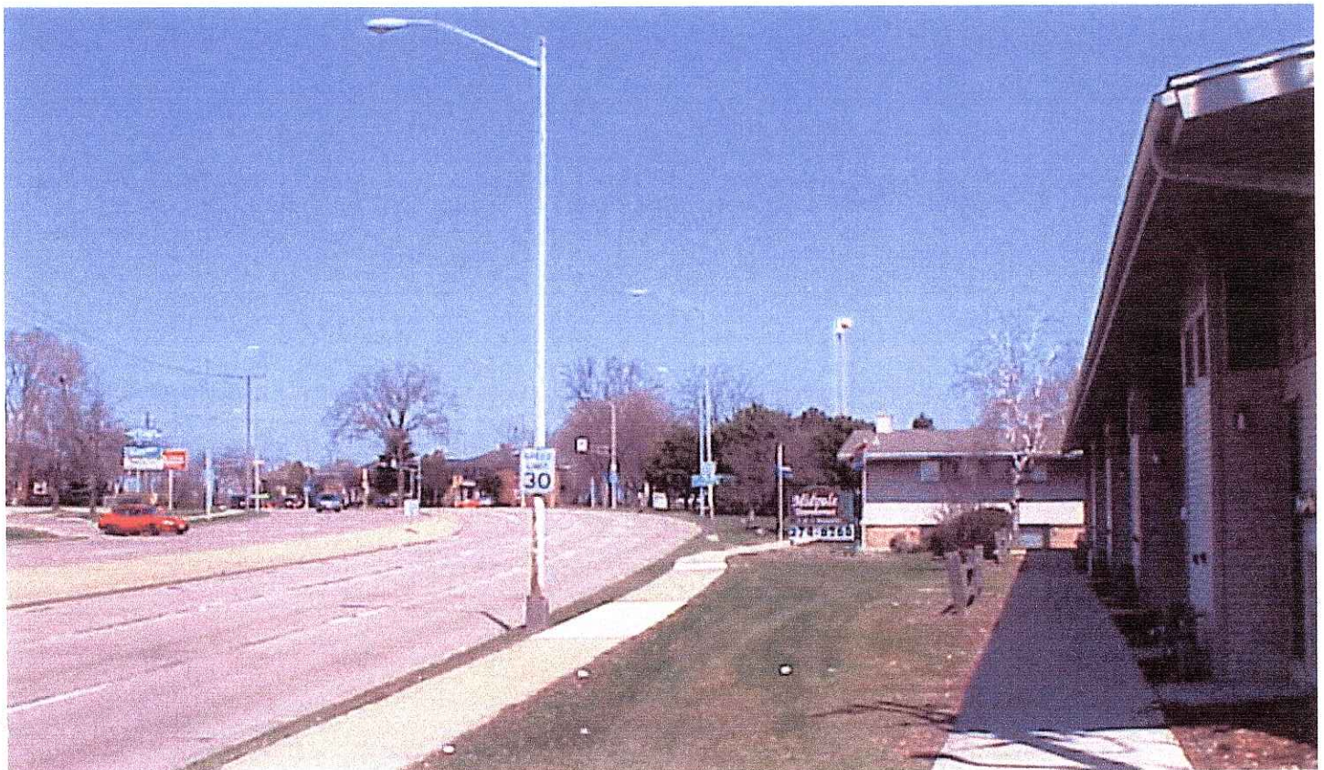
Midvale Boulevard Frontage Facing Northeast