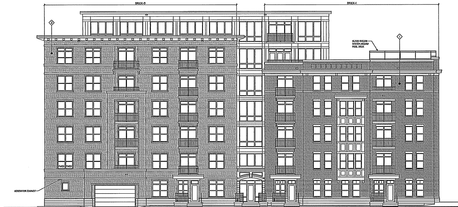
1 ELEVATION ALONG IOTA COURT 1/8" = 1'-0"