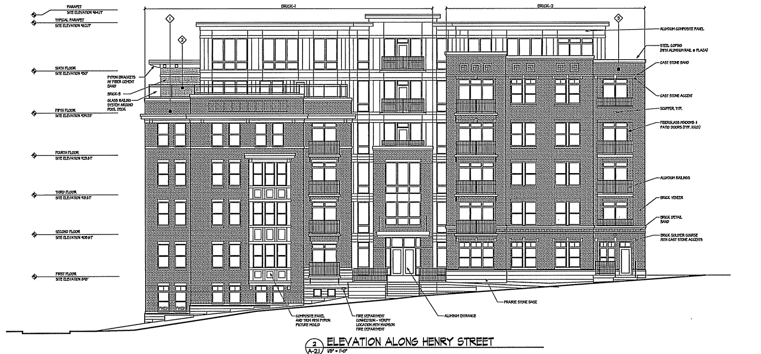
2 ELEVATION ALONG HENRY STREET 1/8" = 1'-0"

Revisions Issued For Preliminary Bidding: March 14, 2013 Contract Set: July 1, 2013 Issued for Plan Review: August 2, 2013 Re-issued for Plan Review: August 14, 2013 Issued for Construction: September 3, 2013 September 26, 2013