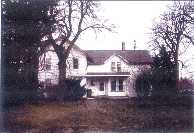
South Side of House Looking North