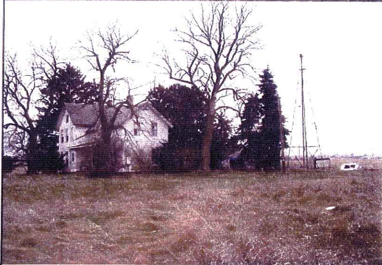
Southeast Portion of Property Looking Northwest