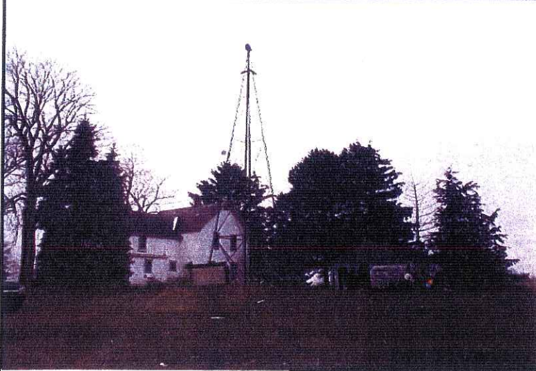
Northeast of House Looking Southwest