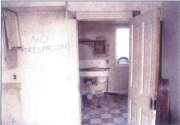
From Kitchen to Back Entry way