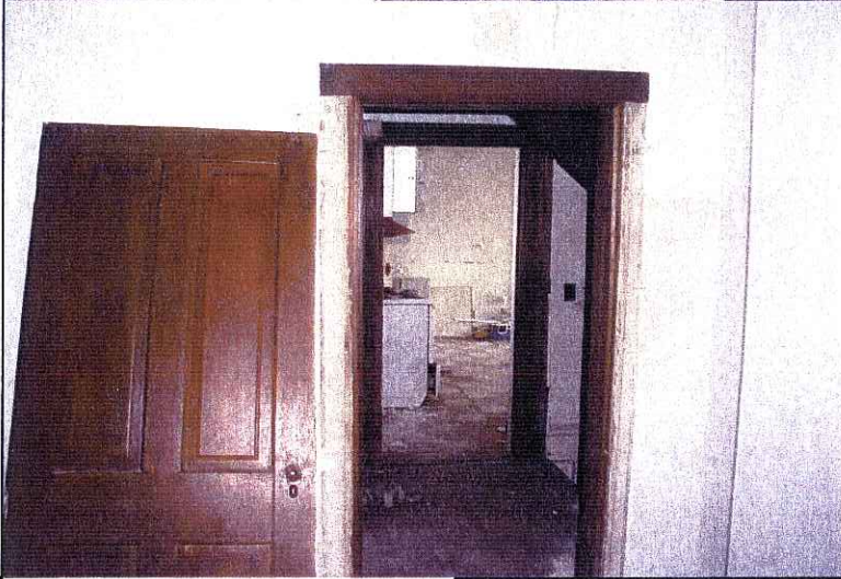
Looking into Kitchen From Bedroom