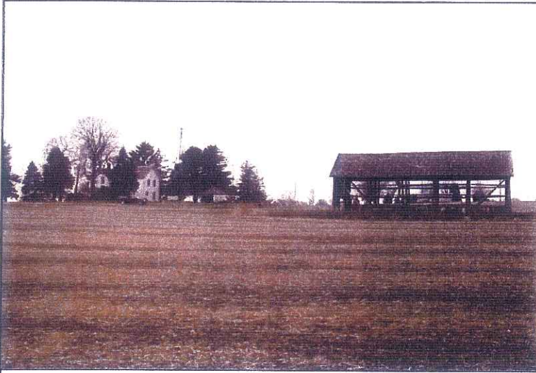
Northeast Portion of Property Looking Southwest