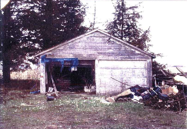
East Side of Garage Looking West