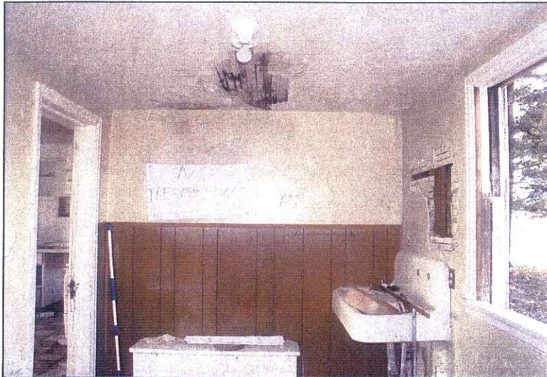
Back Entry Way