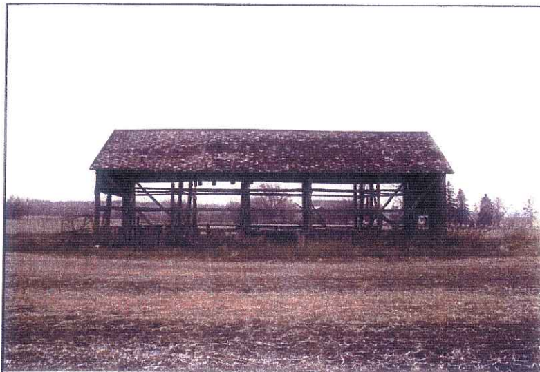
East Side of Barn Looking West