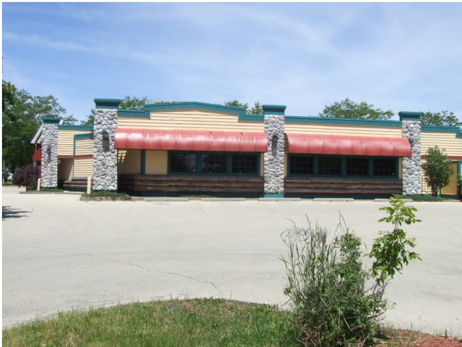
View from south (rear of building)