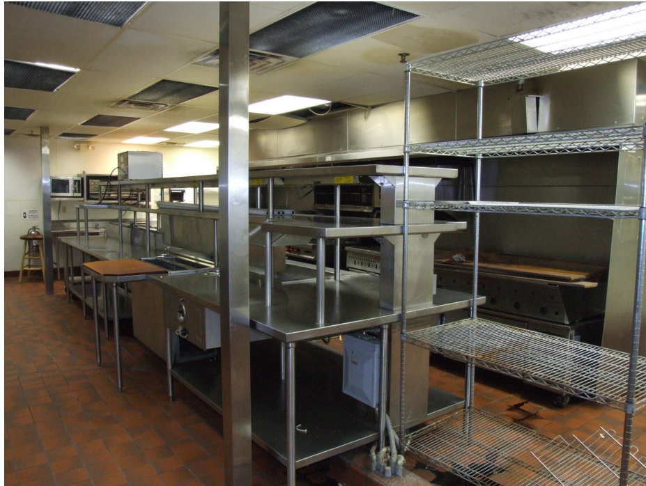
View of kitchen equipment