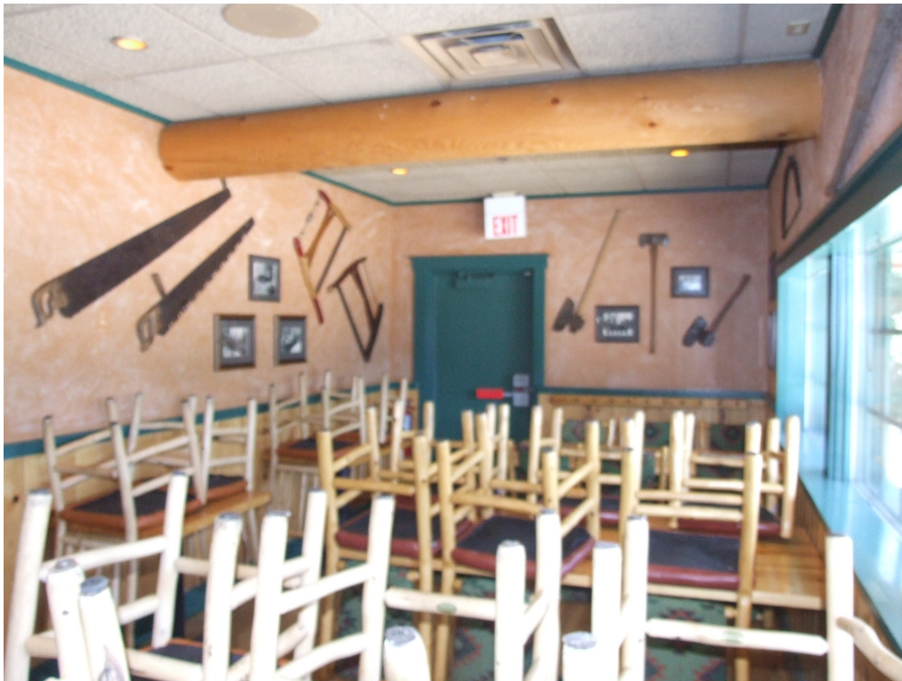
View of interior dining area