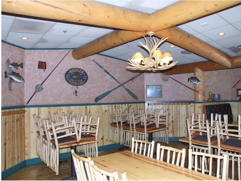
View of interior dining area