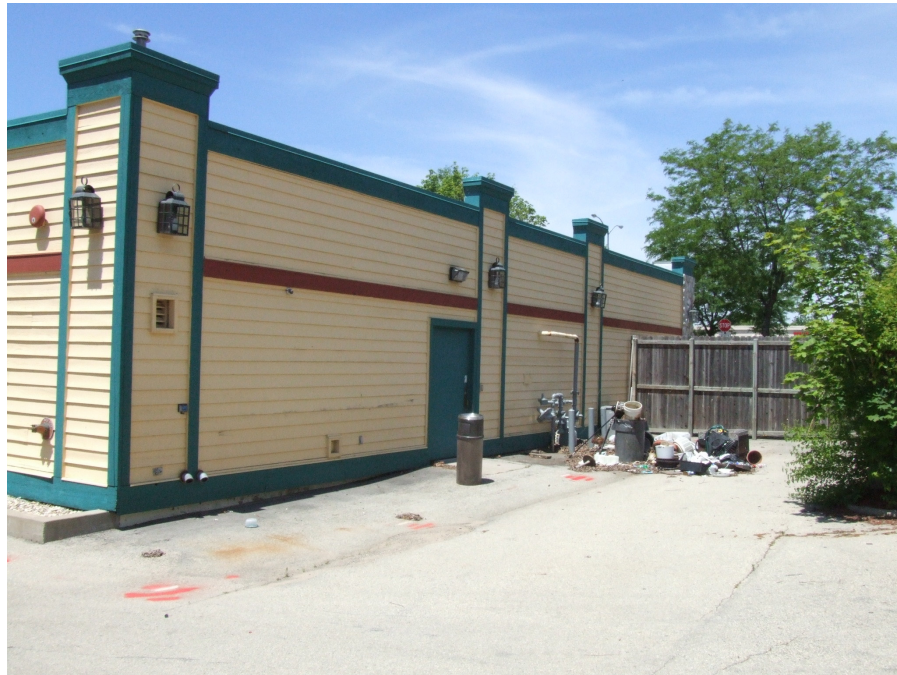
View of service area of building (east side)