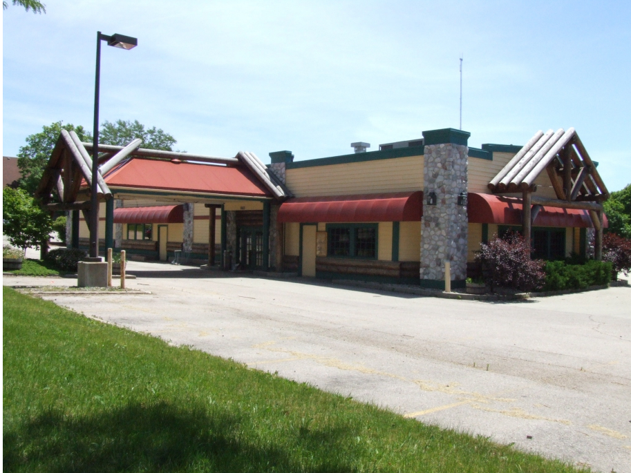
View from Mineral Point Rd. at Grand Canyon intersection (front entry)