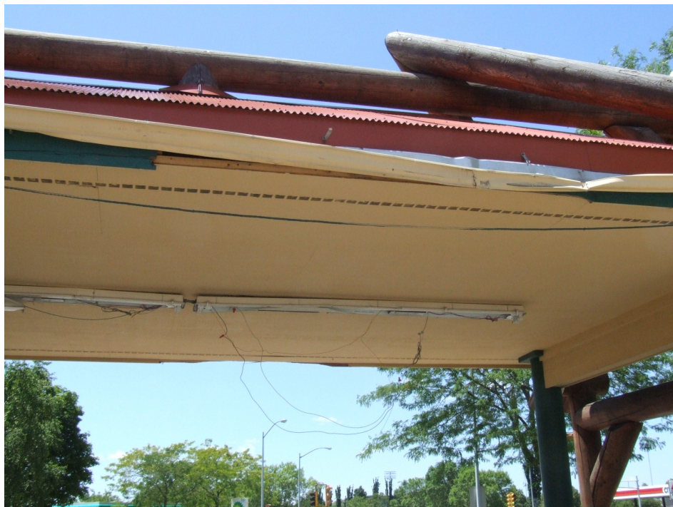
View of entry canopy (in disrepair)