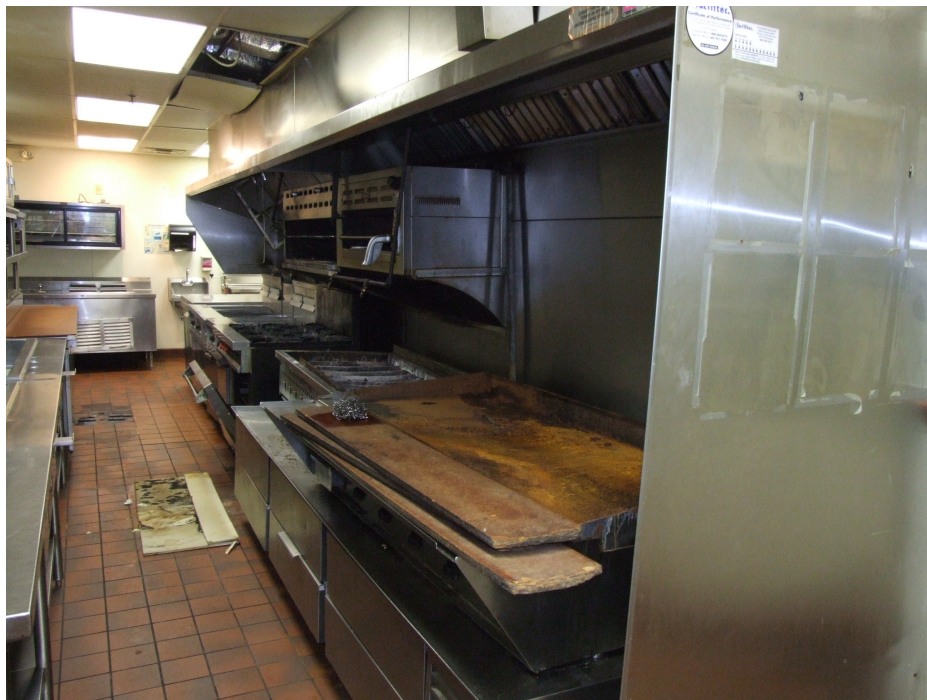
View of kitchen equipment