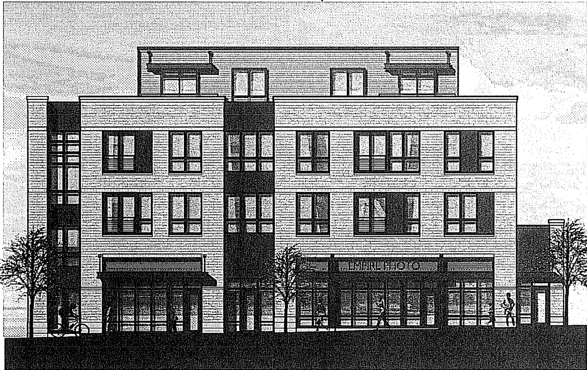
MONROE STREET ELEVATION