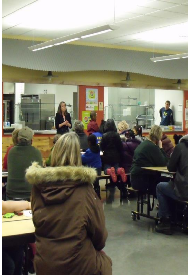
South Madison Food Enterprise, Badger Rock Middle School