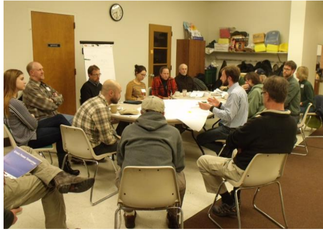
Jenifer Street Reconstruction, 2015