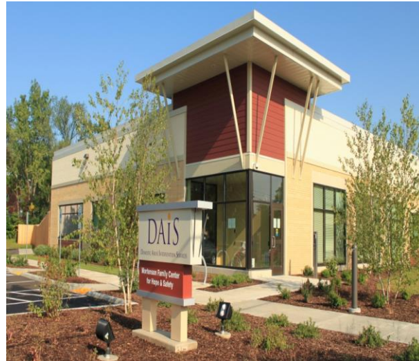
Domestic Abuse Intervention Services, Inc., 2013