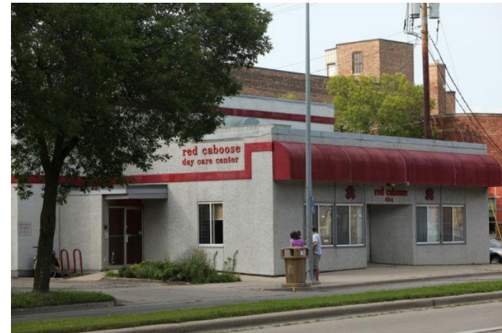
Red Caboose Day Care, present