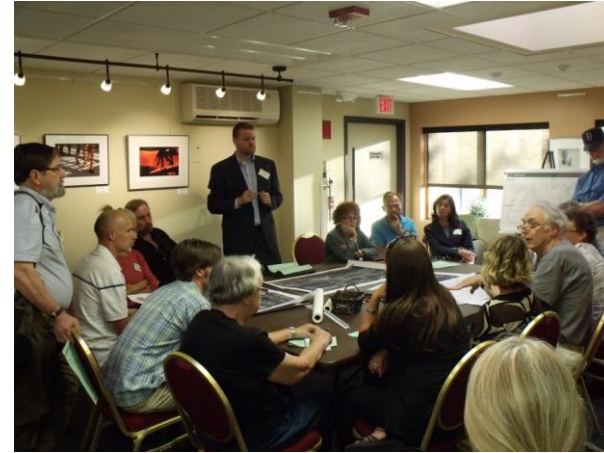
South Capital Transit Oriented Development District Planning Study, 2014