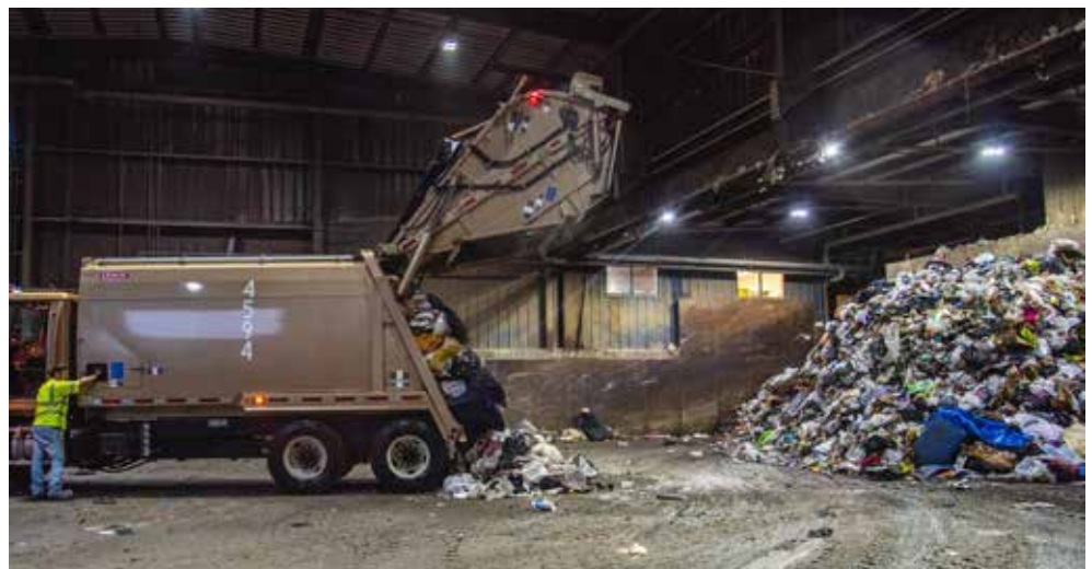
The Streets Division collects 45,000 tons of trash every year.

Still searching for how to handle a particular item? Check the disposal guide that starts on page 26 . If it's not in the guide, feel free to call our offices for advice.