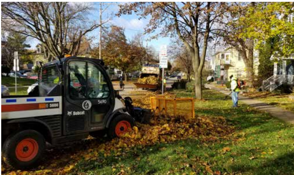
Curbside leaf collection operations.