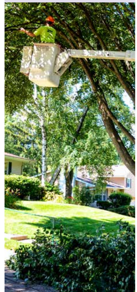
Pruning trees is not for people afraid of heights!

Consult a certified arborist. Find one at the Wisconsin Arborist Association's website: www.waa-isa.org .