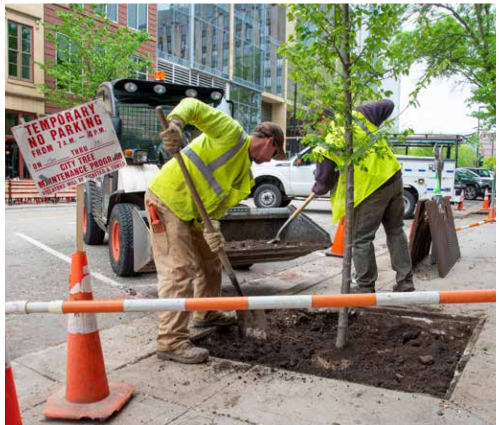
It takes a team to plant a tree.

Further details about the history of the charge and the specifics on how it is calculated can be found on the Urban Forestry website: www.cityofmadison.com/forestry .