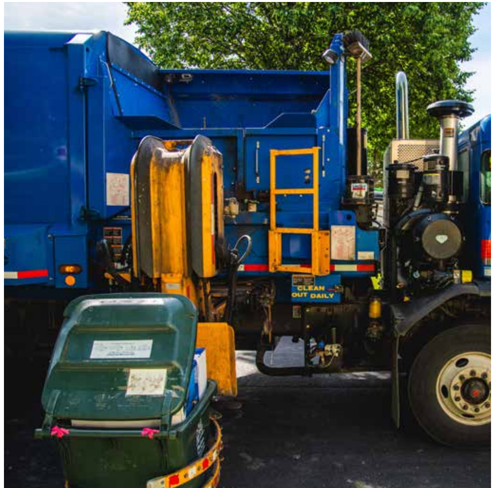
Automated truck collecting an overstuffed recycling cart. This resident should flatten the boxes or upsize their cart for free.

Use the guide on page 10 to learn what can go into the recycling cart.