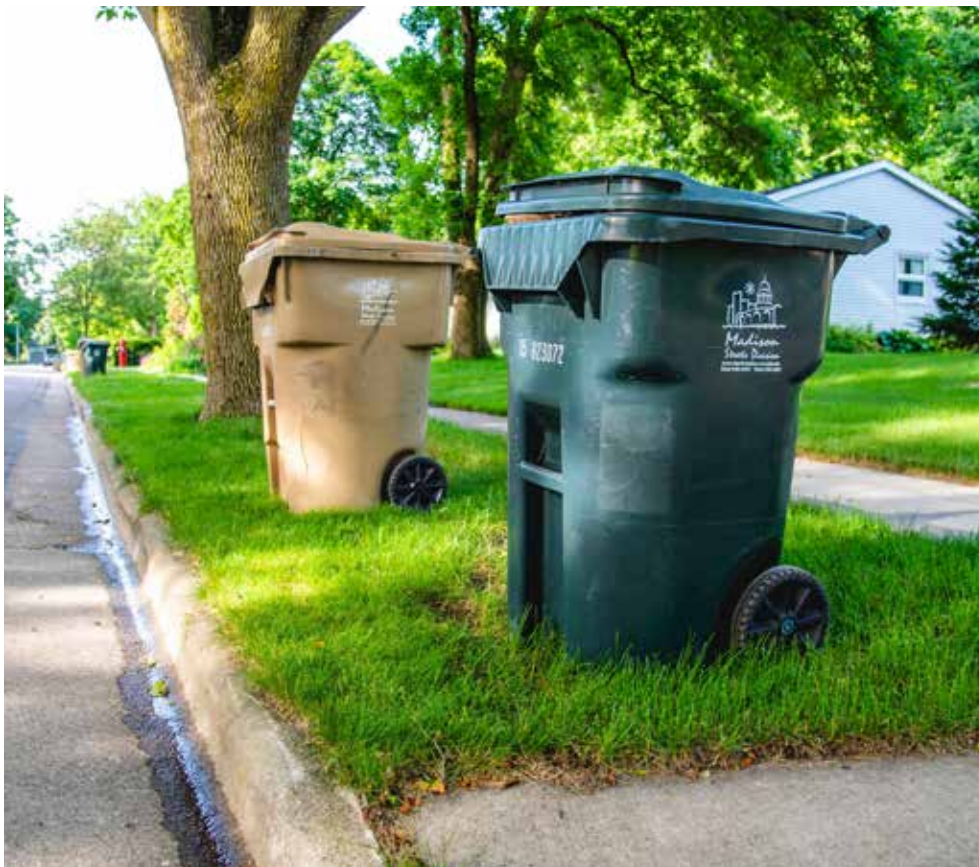
Recycling and refuse cart ready for collection and following the guidelines.