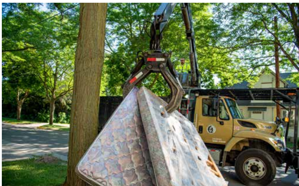
Collecting a mattress & box spring with a truck-mounted crane.