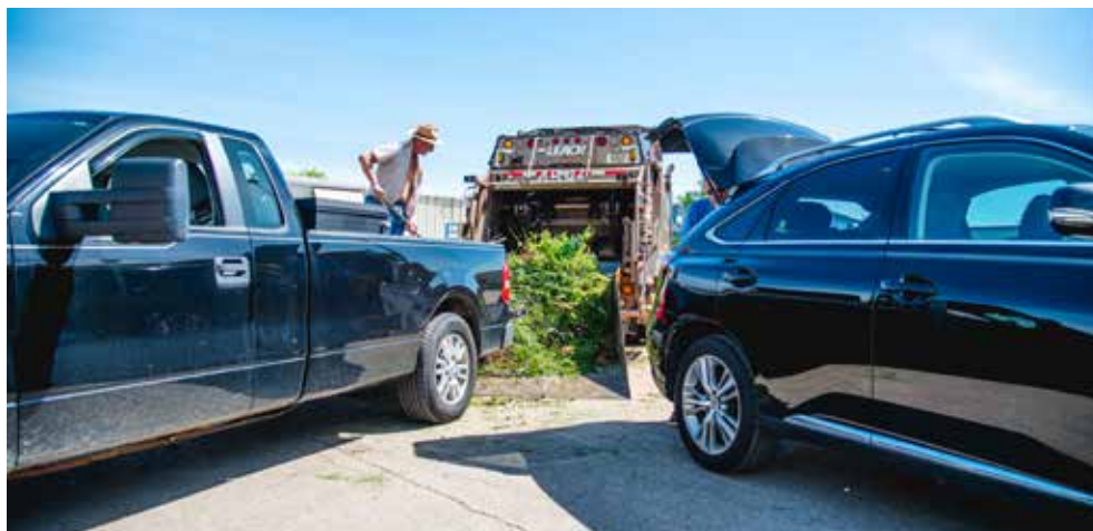
The drop-off sites are busy places. Be sure you pack patience along with the items for disposal.

*These items may require a recycling fee. For information on which items require a fee and where to buy them, turn to page 12 and page 13 .