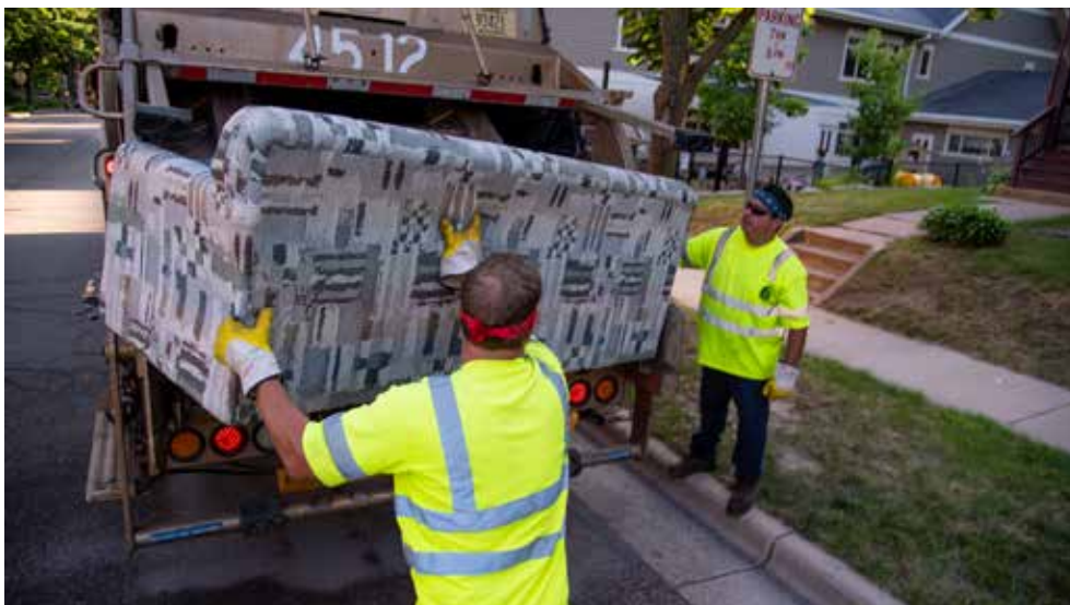
Donate or re-sell your usable items so they don't go to the landfill, like this couch.

Using the carts correctly makes collection faster and safer for our crews. The dates on when the extra collections begin can be found on the moving days website.