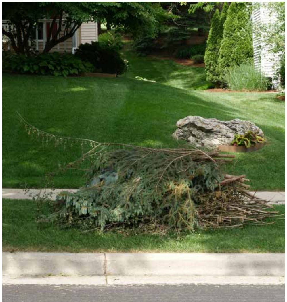
It is stacked neatly. The cut ends are facing the same direction. The pieces are the correct size.