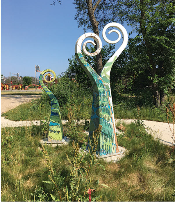
Sculpture by Sonia Valle

Admire the “Fern Family” sculptures during your ride on Cannonball Path.