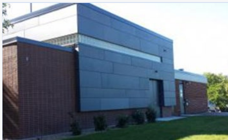
Municipal Well 15 PFAS Treatment Project Design of PFAS treatment facility at Well 15 to remove PFAS, PCE and TCE. Total project costs (estimate)*: $5.9M