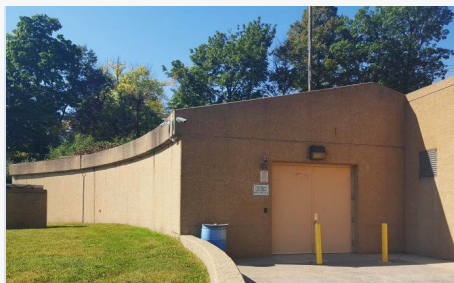
Municipal Well 19 Well Treatment Project Treatment facility at Well 19 to remove iron, manganese, and radium. Total project costs (estimate)*: $9.1 M