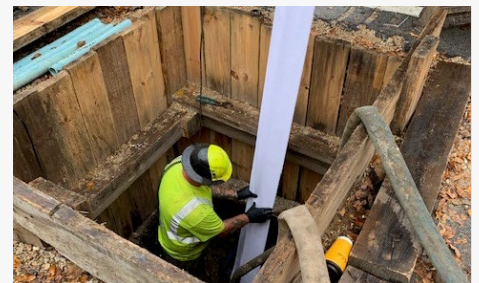
Water Main Rehabilitation Lake Mendota Dr. & Cannonball Trail Tech used to rehabilitate aging water mains back to full structural strength. Total projects cost: $1.1M