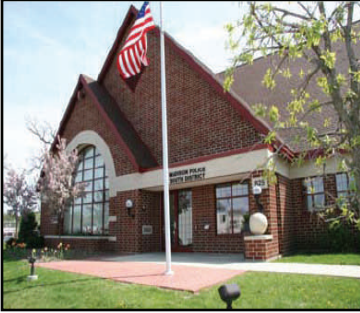
Madison Police Department—South District