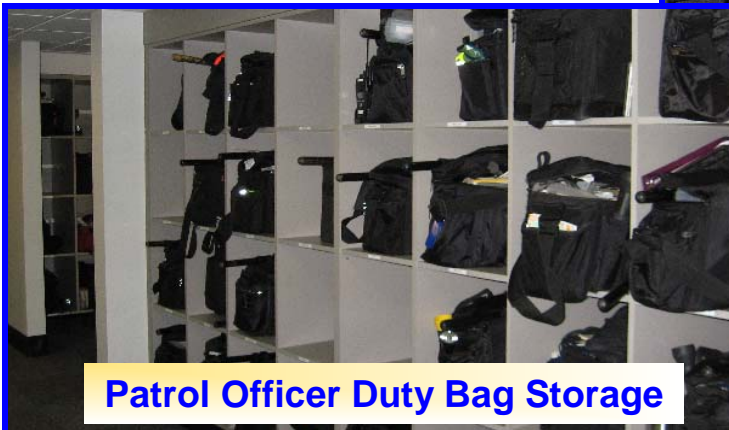
Patrol Officer Duty Bag Storage

break room, storage rooms and smaller conference rooms.