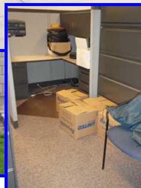
Temporary Spaces.... Madison Municipal Building, far left; Water Utility Building above; and the moving challenge, near left.