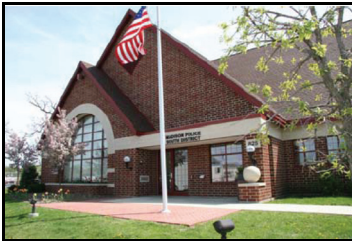
Madison Police Department—South District