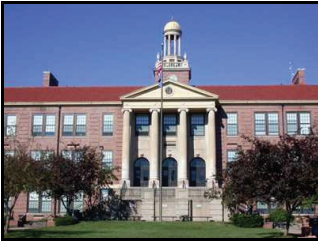
West High School