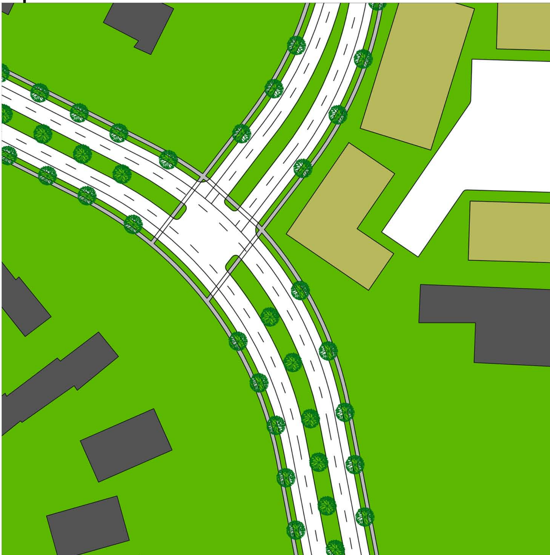
Option B - "T" Intersection