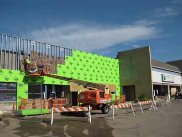
Picture above shows crews constructing the new exterior wall at Sports Town & MATC South Campus