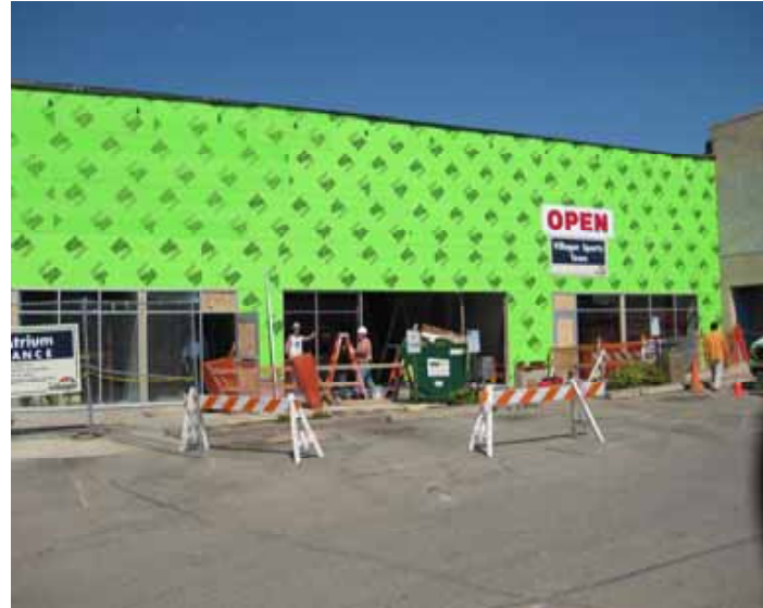
Picture above new store front at Sports Town & MATC South Campus