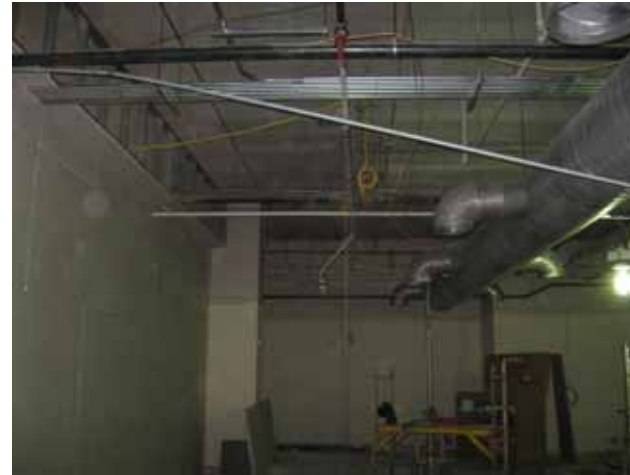
Picture above shows new exposed duct work in one of the new basement rooms.