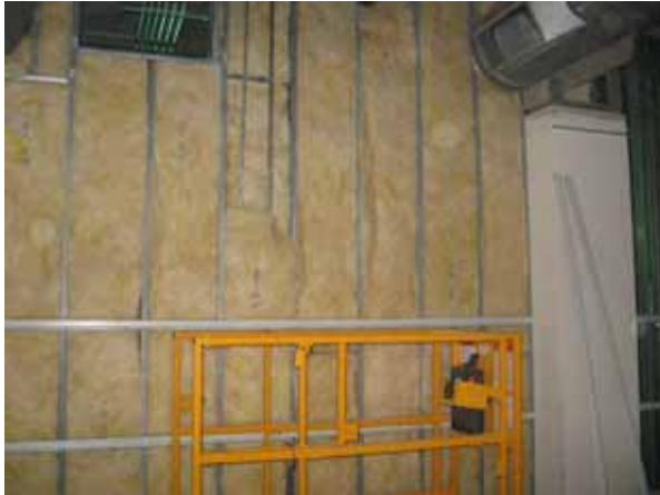
Picture above is of one of the new basement walls. Crews have just finished installing sound insulation.