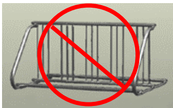
Grid or Fence Style Racks