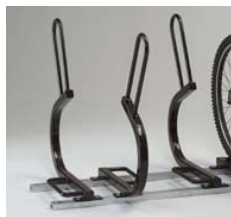
Madrax Sentry Rack