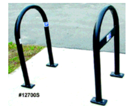
Inverted-U Type Racks