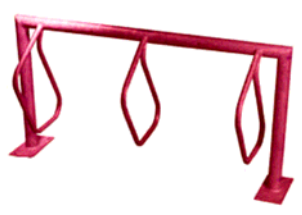
Dero Campus Rack