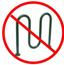
Wave or Ribbon Style racks