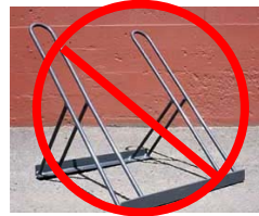
Racks that hold the bike by the wheel with no way to lock the frame and wheel to the rack with a U-lock