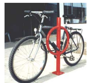
Dero Bike Hitch