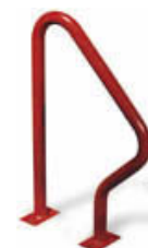
Dero Swerve Rack