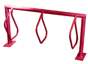
Dero Campus Rack