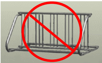
Grid or Fence Style Racks