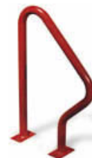
Dero Swerve Rack